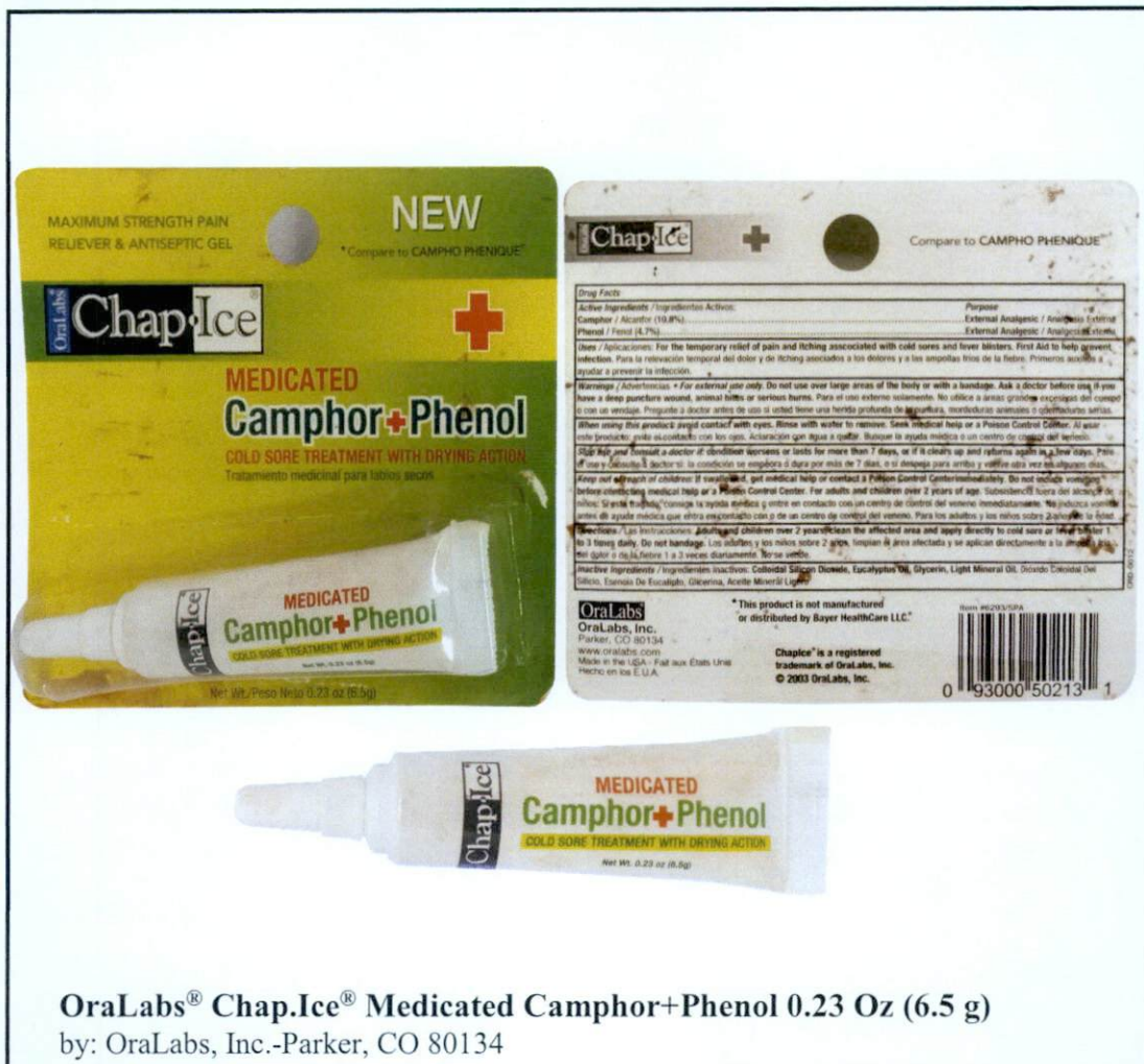
OraLabs® Chap.Ice® Medicated Camphor+Phenol 0.23 Oz (6.5 g) by: OraLabs, Inc.-Parker, CO 80134

The Food and Drug Administration (FDA) advises the public against the purchase and use of the following unregistered drug products: