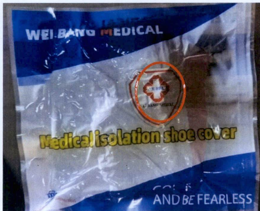
Figure 1. Unnotified Wei Bang Medical Isolation Shoe Cover

The Food and Drug Administration (FDA) warns all healthcare professionals and the general public NOT TO PURCHASE AND USE the unnotified medical device products: