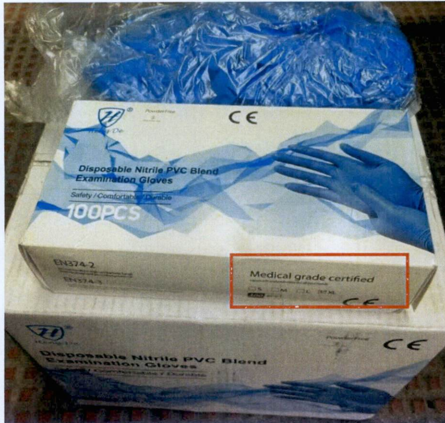
Figure 3. Unnotified Heng De Disposable Nitrile PVC Blend Examination Gloves

The FDA verified through post-marketing surveillance that the above mentioned medical device products are not notified and no corresponding Product Notification Certificates have been issued. Pursuant to the Republic Act No. 9711, otherwise known as the “Food and Drug Administration Act of 2009”, the manufacture, importation, exportation, sale, offering for sale, distribution, transfer, non-consumer use, promotion, advertising or sponsorship of health products without the proper authorization is prohibited.