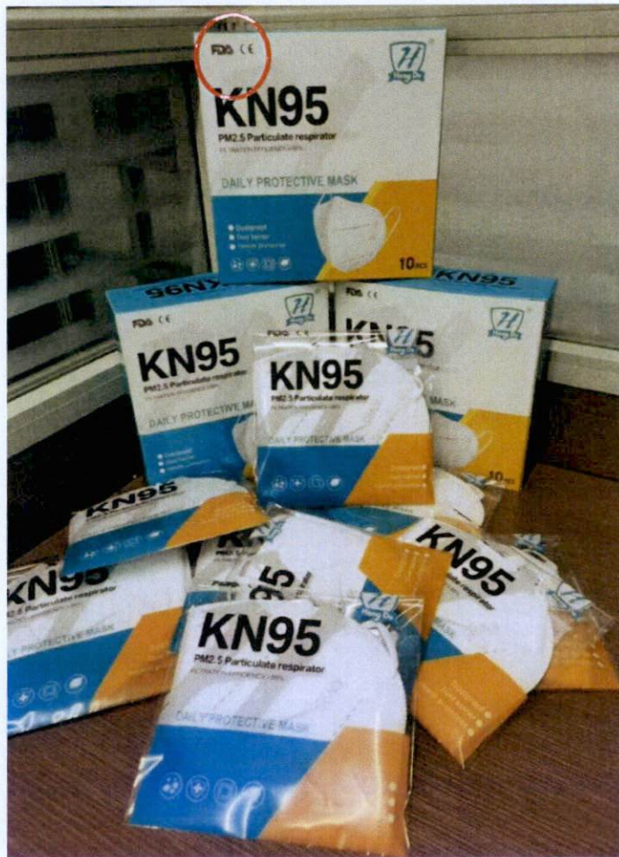
Figure 2. Unnotified Heng De KN95 PM2.5 Particulate Respirator