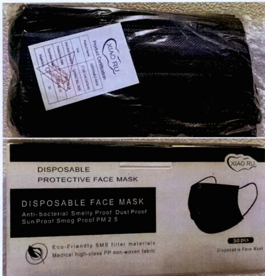
Figure 1. Unnotified Xiao Ru Disposable Face Mask

The Food and Drug Administration (FDA) warns all healthcare professionals and the general public NOT TO PURCHASE AND USE the unnotified medical device products: