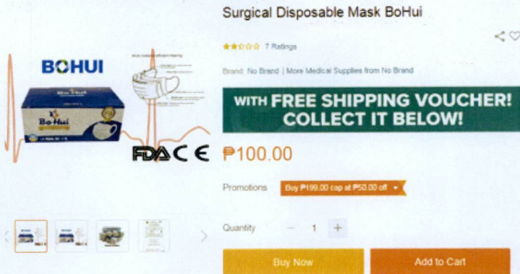
Figure 4. Unnotified Bo Hui Disposable Protective Mask

The FDA verified through post-marketing surveillance that the above mentioned medical device products are not notified and no corresponding Product Notification Certificates have been issued. Pursuant to the Republic Act No. 9711, otherwise known as the “Food and Drug Administration Act of 2009”, the manufacture, importation, exportation, sale, offering for sale, distribution, transfer, non-consumer use, promotion, advertising or sponsorship of health products without the proper authorization is prohibited.