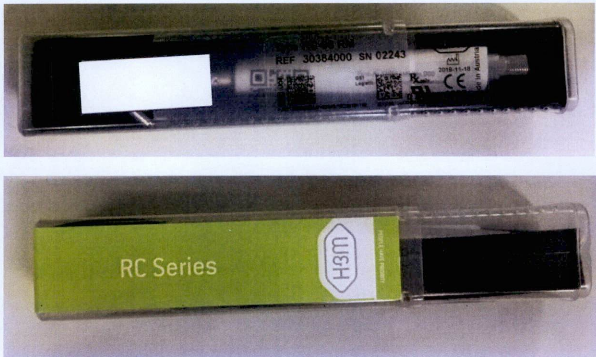
Figure 1. Unnotified RC Series RC-98 RM

The Food and Drug Administration (FDA) warns all healthcare professionals and the general public NOT TO PURCHASE AND USE the unnotified medical device product: