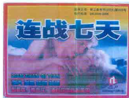
27. Lian Zhan Qi Tian 2500 mg Capsule