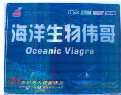
32. Oceanic Viagra 2000mg Capsule