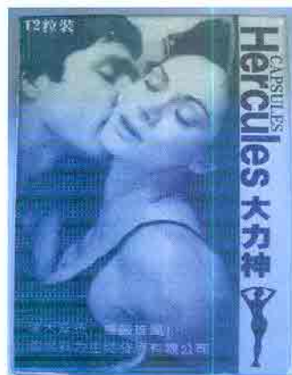
19. Hercules Capsule