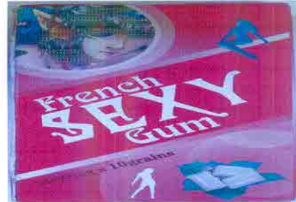
14. French Sexy Gum 2000mg