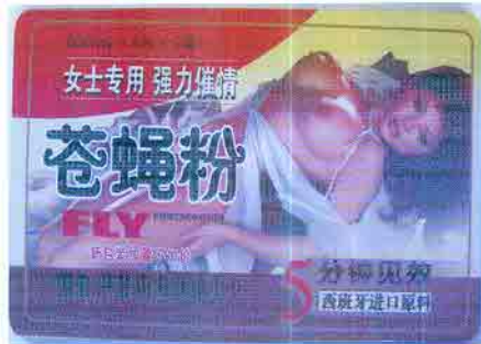
13. Fly 800 mg Sachet