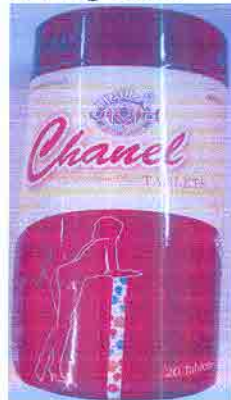
11. Chanel 600 mg Tablet