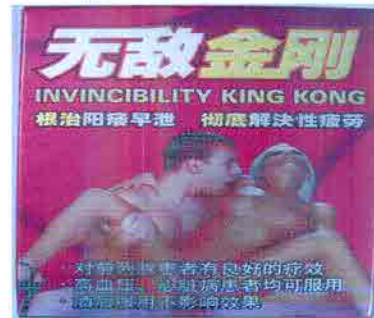
22. Invincibility King Kong 3500 mg Tablet