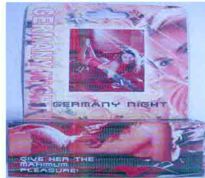
16. Germany Night 5 mL