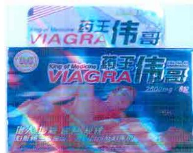
26. King of Medicine Viagra 2500 mg Capsule