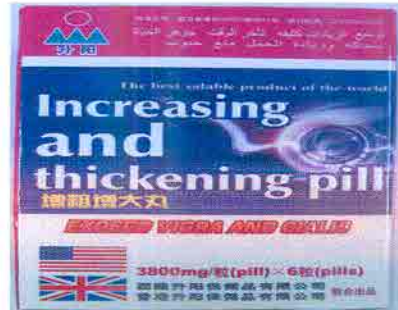
8. Bayer Increasing and Thickening Pill 3800 mg Capsule