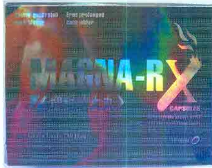
29. Magna-RX Capsule