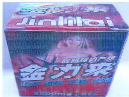
25. Jinlilai 2500 mg Capsule