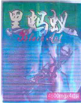
9. Black Ant 4600 mg Capsule