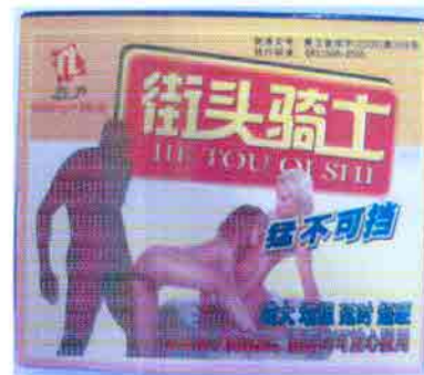
24. Jie Tou Qi Shi 2500 mg Capsule