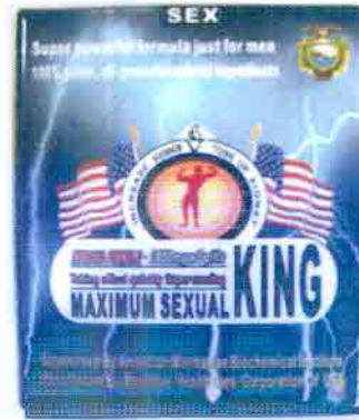
30. Maximum Sexual King 1800 mg Tablet