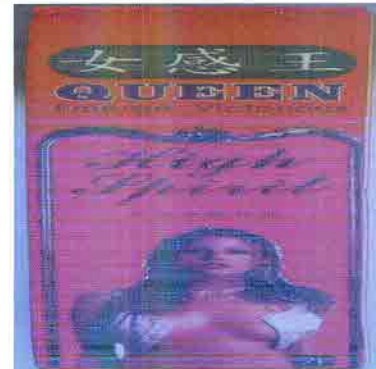
34. Queen Emerge Victorious High Spirit 10 mL