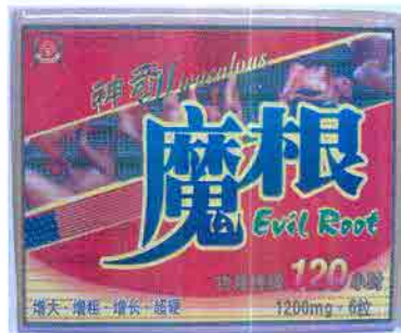
31. Miraculous Evil Root 1200 mg Capsule