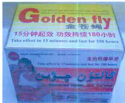
17. Golden Fly 3000 mg