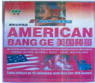
5. American Bang Ge 2800 mg