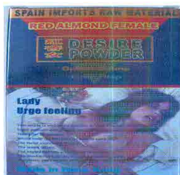
35. Red Almond Female Desire Powder 4500 mg Sachet