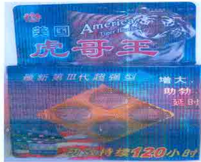
7. America Tiger Brother 1800 mg Tablet