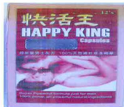
18. Happy King Capsule