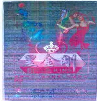
10. Black King 1800 mg Capsule