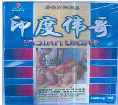
21. Indian Vigra 2800 mg Capsule