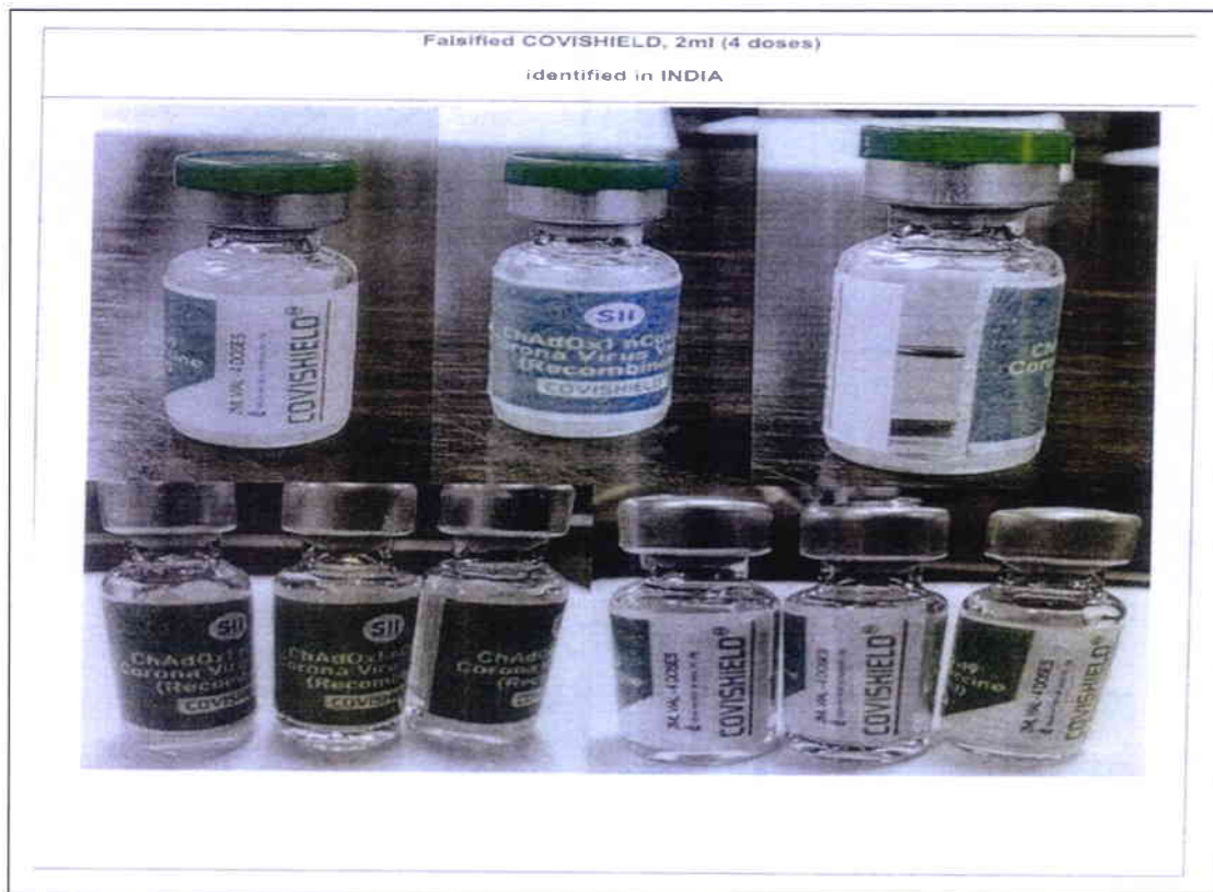
Figure 2. Falsified 2mL COVID-19 vaccine “COVISHIELD” identified in India

The FDA strongly advises the public to be vigilant on the circulation of this falsified COVID-19 vaccines since this poses a serious risk to global public health and further increases the burden on vulnerable populations and health systems. A falsified vaccine deliberately or fraudulently misrepresents identity, composition, or source, and upon confirmation with the genuine manufacturer, it was confirmed that the 2mL doses are not produced by them and the 5 mL doses are falsified.