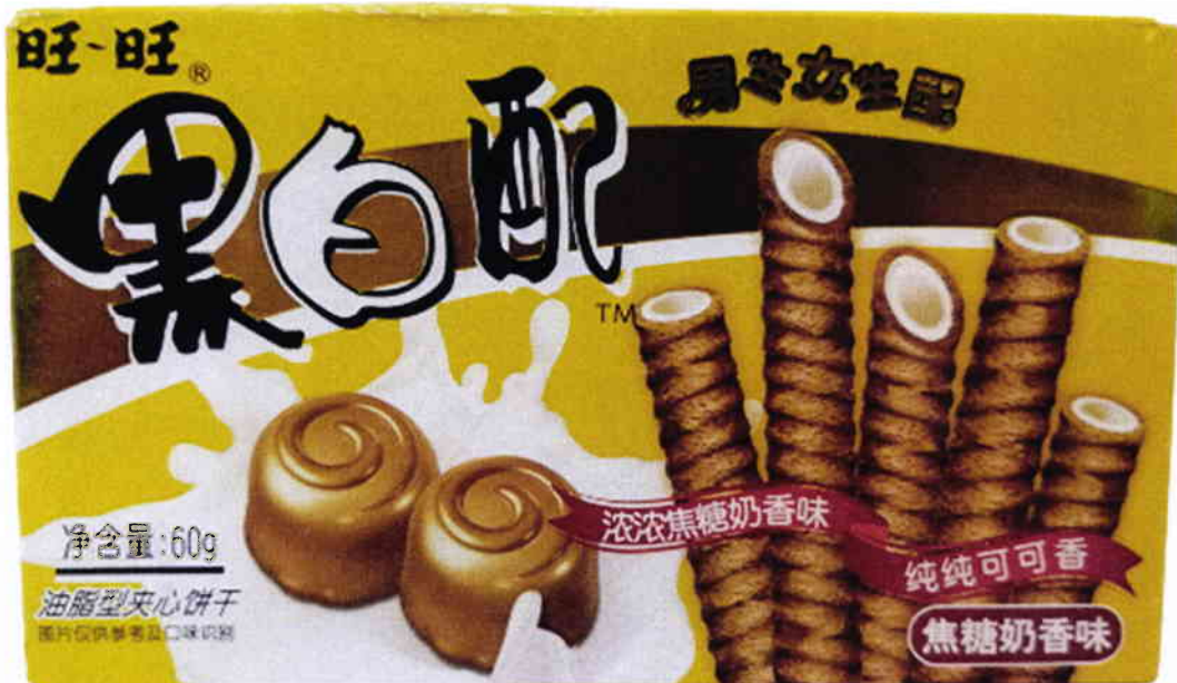
Figure 1. Unregistered Wafer Sticks in Yellow Box (In Foreign Language)

The Food and Drug Administration (FDA) warns all healthcare professionals and the general public NOT TO PURCHASE AND CONSUME the following unregistered food products: