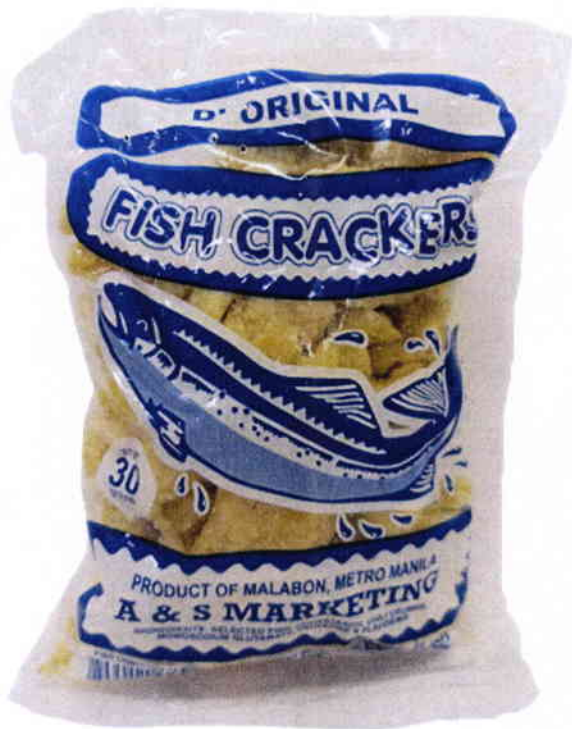
Figure 2. Unregistered D' ORIGINAL Fish Crackers