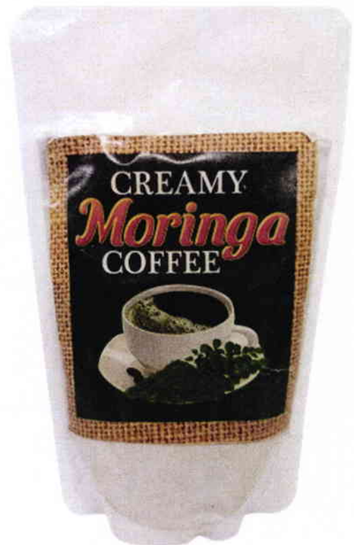
Figure 4. Unregistered Creamy Moringa Coffee