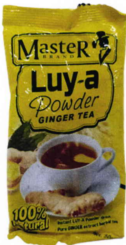
Figure 3. Unregistered MASTER BRAND Luy-a Powder Ginger Tea