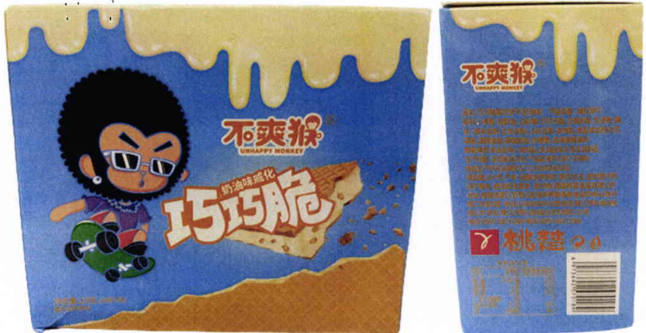
Figure 4. Unregistered UNHAPPY MONKEY Wafer in Sky Blue Box (In Foreign Language)