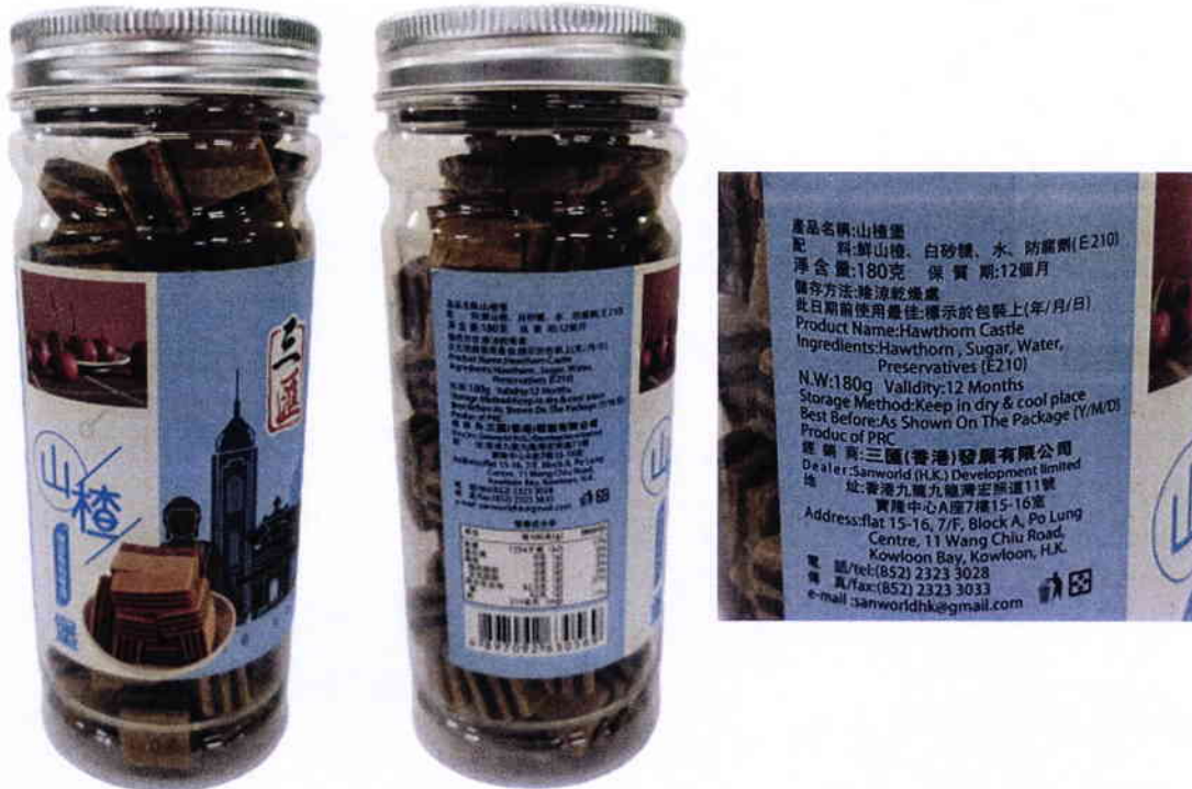
Figure 1. Unregistered Hawthorn Castle Food Product with Blue Label in Transparent Jar (In Foreign Language)

The Food and Drug Administration (FDA) warns all healthcare professionals and the general public NOT TO PURCHASE AND CONSUME the following unregistered food products: