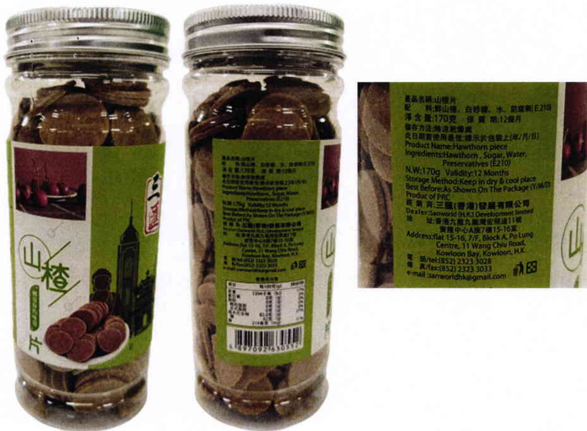
Figure 2. Unregistered Hawthorne Piece Food Product with Green Label in Transparent Jar (In Foreign Language)