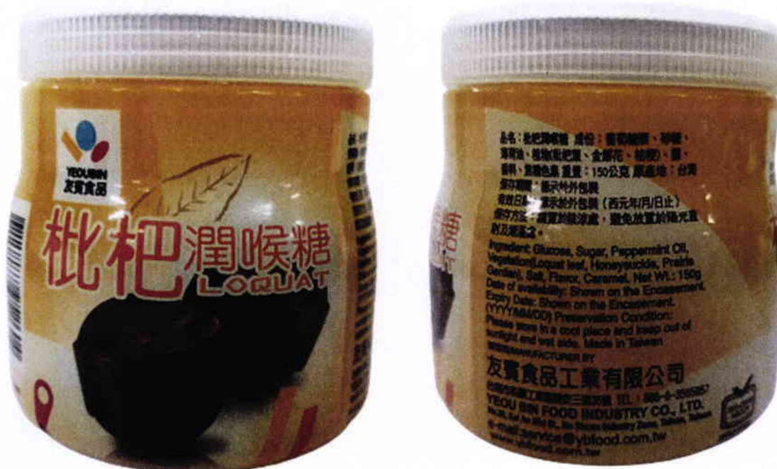
Figure 3. Unregistered YEOUNBIN Loquat (In Foreign Language)