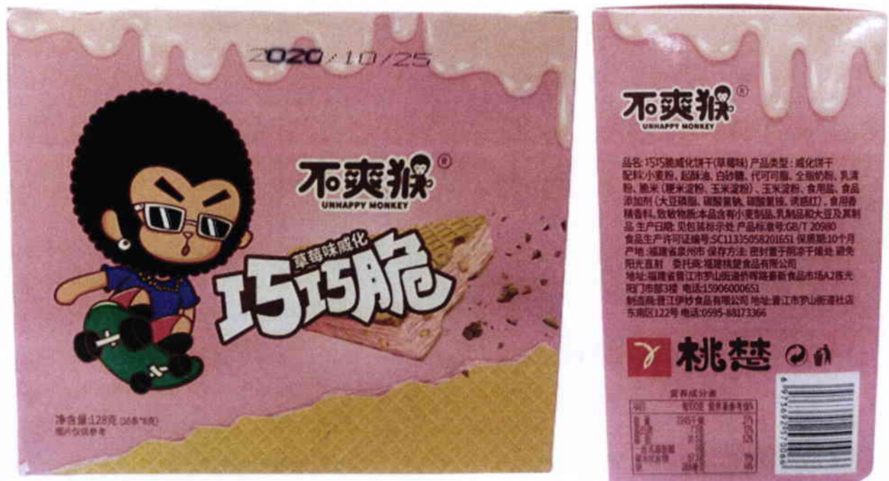
Figure 5. Unregistered UNHAPPY MONKEY Wafer in Pink Box (In Foreign Language)