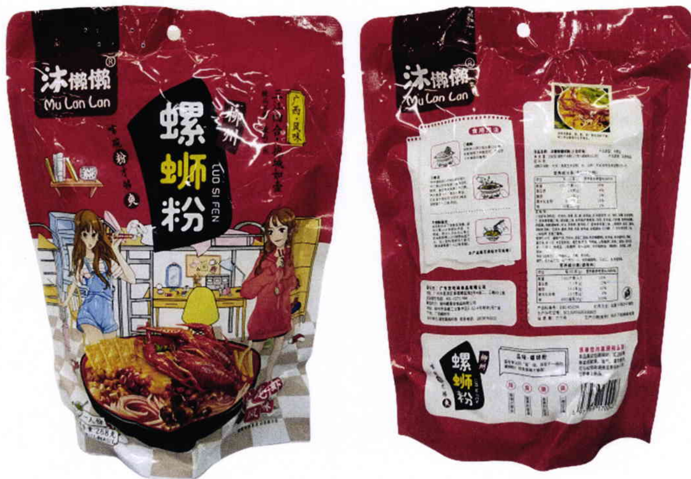
Figure 4. Unregistered MU LAN LAN Luo Si Fen Food Product in Red and White Stand-up Pouch (In Foreign Language)

The FDA verified through online monitoring or post-marketing surveillance that the abovementioned food products are not registered and no corresponding Certificates of Product Registration (CPR) have been issued. Pursuant to the Republic Act No. 9711, otherwise known as the “Food and Drug Administration Act of 2009”, the manufacture, importation, exportation, sale, offering for sale, distribution, transfer, non-consumer use, promotion, advertising or sponsorship of health products without the proper authorization is prohibited.