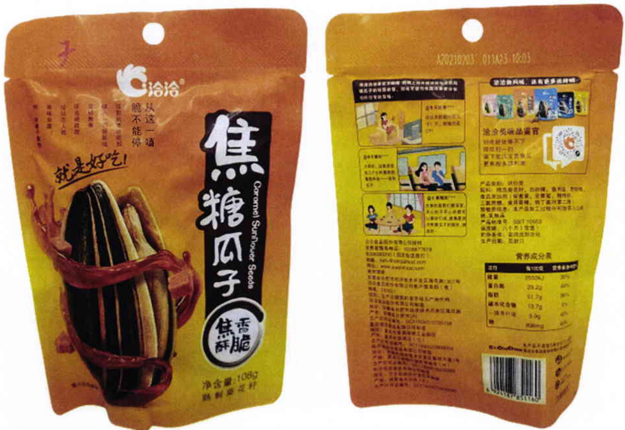
Figure 3. Unregistered Caramel Sunflower Seeds in Orange Stand-up Pouch (In Foreign Language)