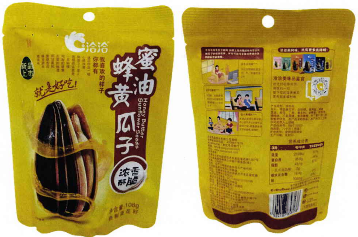
Figure 2. Unregistered Honey Butter Sunflower Seeds in Yellow Stand-up Pouch (In Foreign Language)