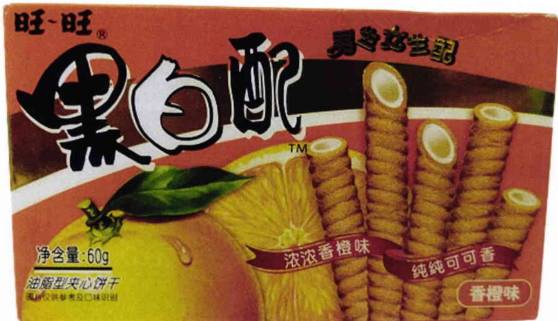
Figure 1. Unregistered Wafer Sticks in Orange Box (In Foreign Language)

The Food and Drug Administration (FDA) warns all healthcare professionals and the general public NOT TO PURCHASE AND CONSUME the following unregistered food products: