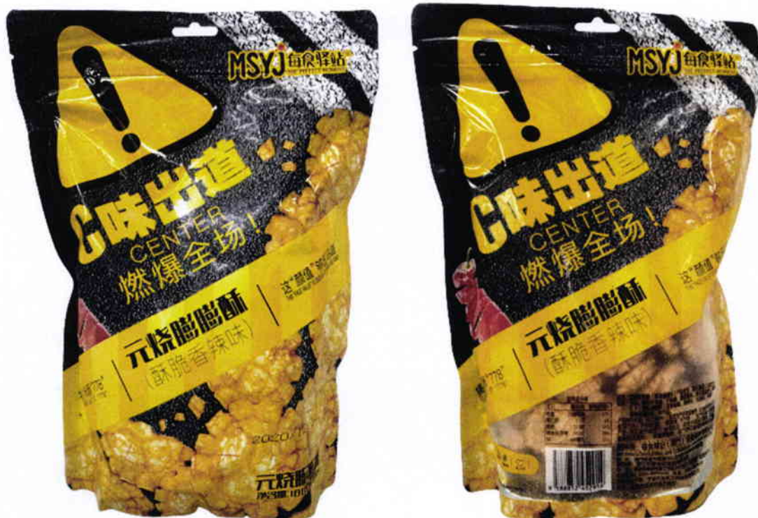
Figure 5. Unregistered MSYJ THE PERFECT MOMENT Center Food Product in Yellow and Black Stand-Up Pouch (In Foreign Language)