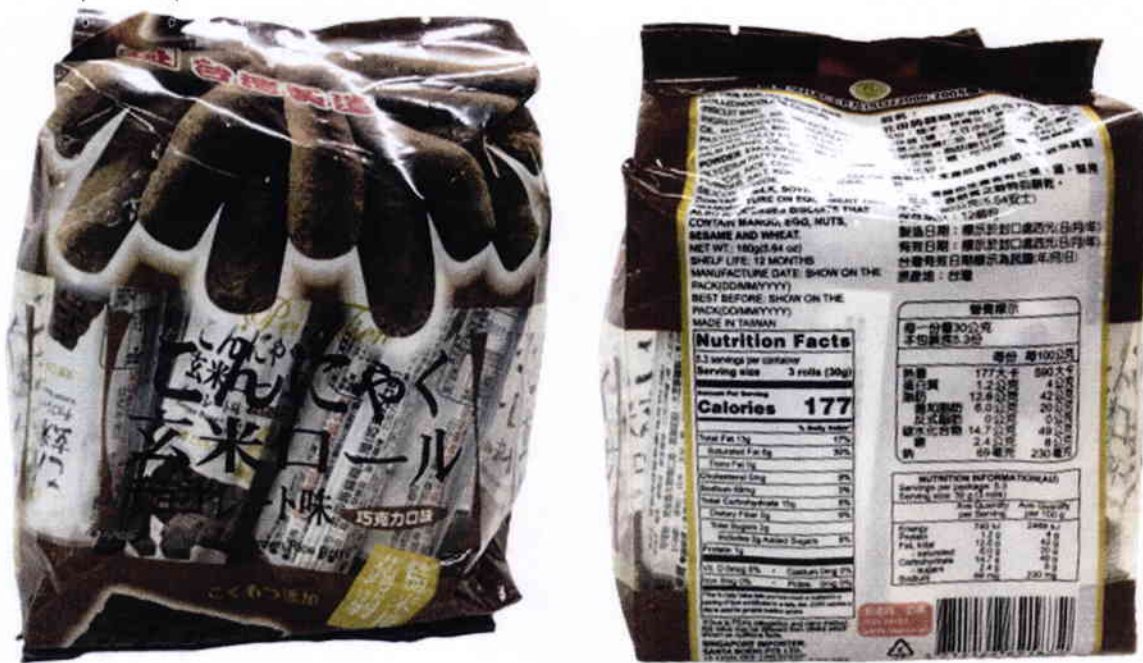
Figure 4. Unregistered PEI TIEN Konjac Brown Rice Roll Chocolate Flavor in Brown Packaging (In Foreign Language)