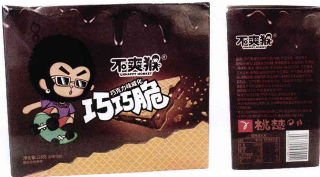
Figure 3. Unregistered UNHAPPY MONKEY in Brown Box (In Foreign Language)