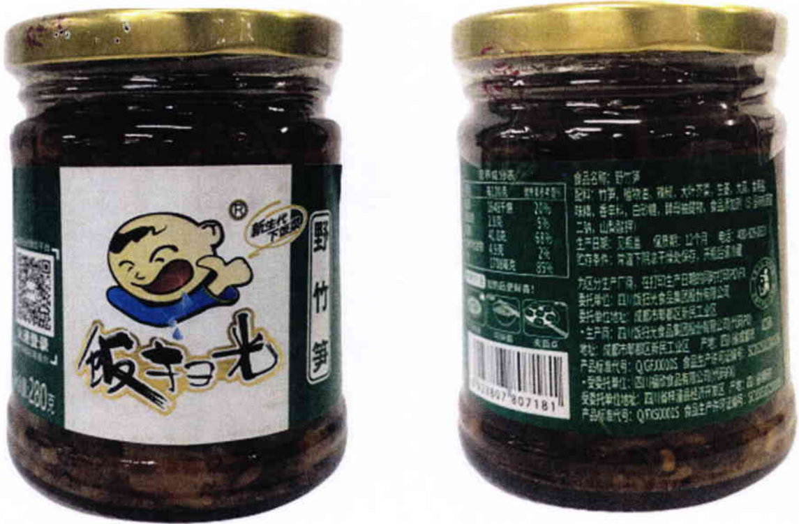
Figure 3. Unregistered Pickled Vegetable with Boy Character and Bright Green Label in Glass Bottle (In Foreign Language)