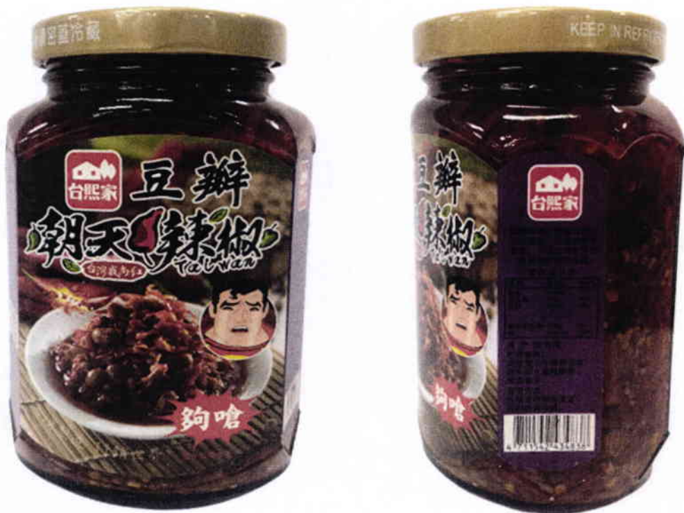
Figure 4. Unregistered TAIWAN Chili sauce with Male Character and Violet Label in Glass Bottle (In Foreign Language)