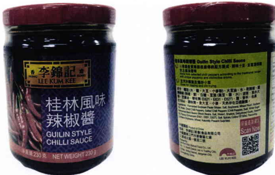
Figure 1. Unregistered LEE KUM KEE Guilin Style Chili Sauce (In Foreign Language)

The Food and Drug Administration (FDA) warns all healthcare professionals and the general public NOT TO PURCHASE AND CONSUME the following unregistered food products: