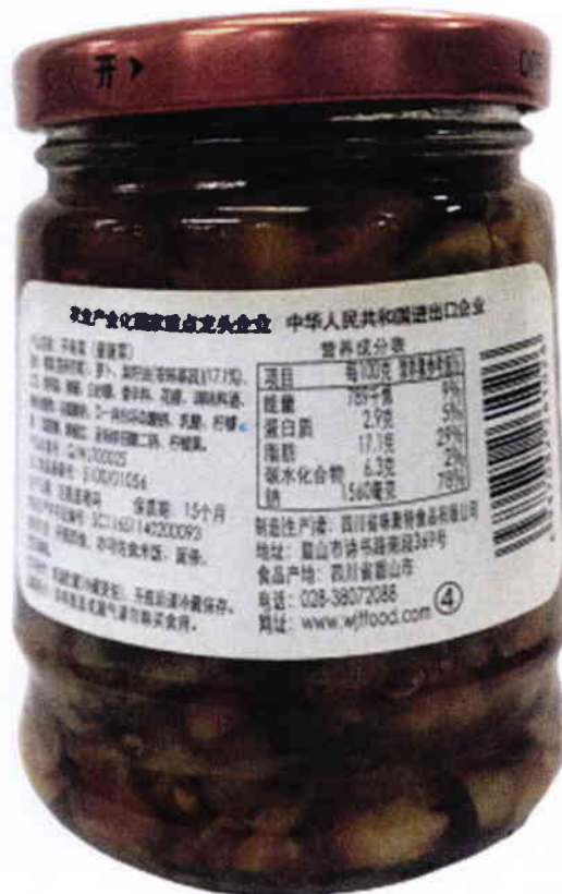
Figure 2. Unregistered Tasty Vegetables with Dark Orange Label in Glass Bottle (In Foreign Language)