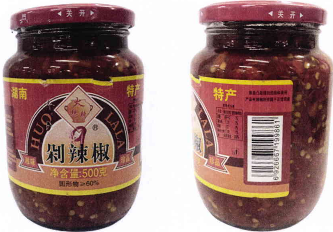
Figure 2. Unregistered HUO LALA Chili Oil with Red and Orange Label in Glass Bottle (In Foreign Language)