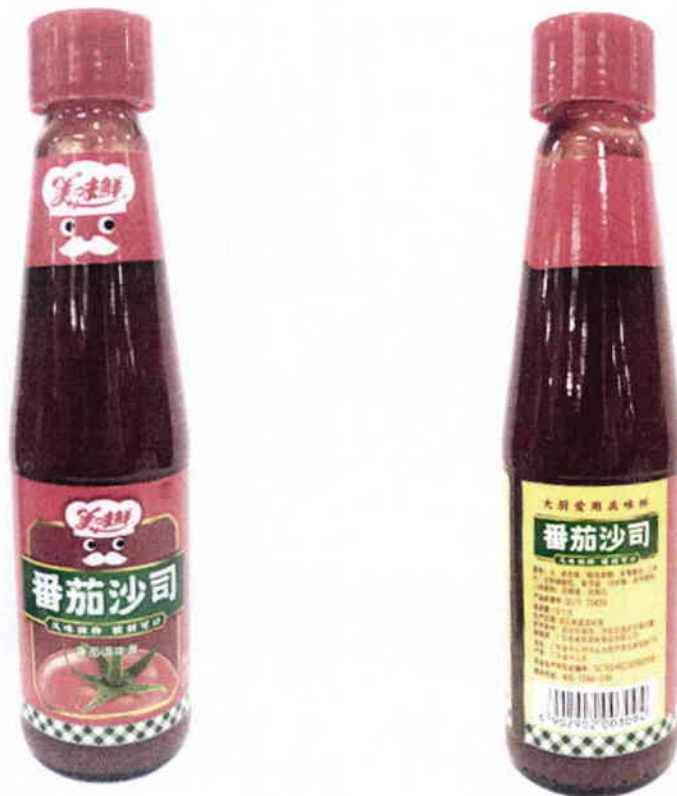
Figure 3. Unregistered Food Product with Tomato Image and Red Label in Glass Bottle (In Foreign Language)