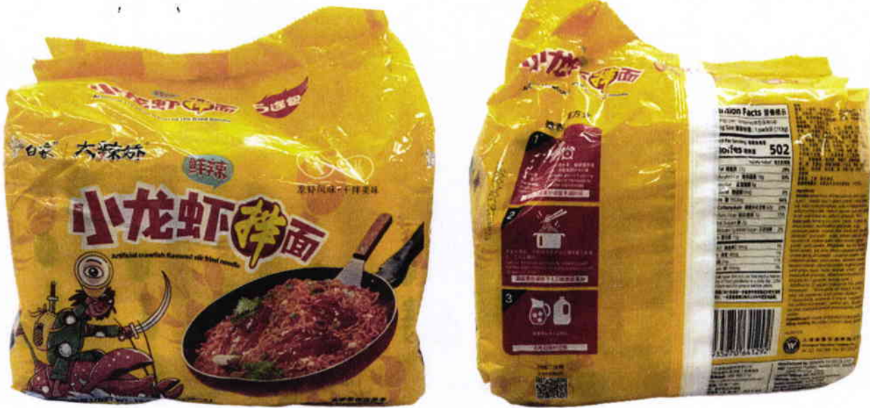
Figure 4. Unregistered Artificial Crawfish Flavored Stir Fried Noodle (In Foreign Language)