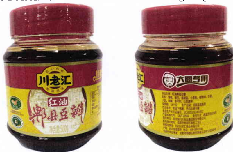
Figure 1. Unregistered Food Product with Red and Yellow Label in Plastic Jar (In Foreign Language)

The Food and Drug Administration (FDA) warns all healthcare professionals and the general public NOT TO PURCHASE AND CONSUME the following unregistered food products: