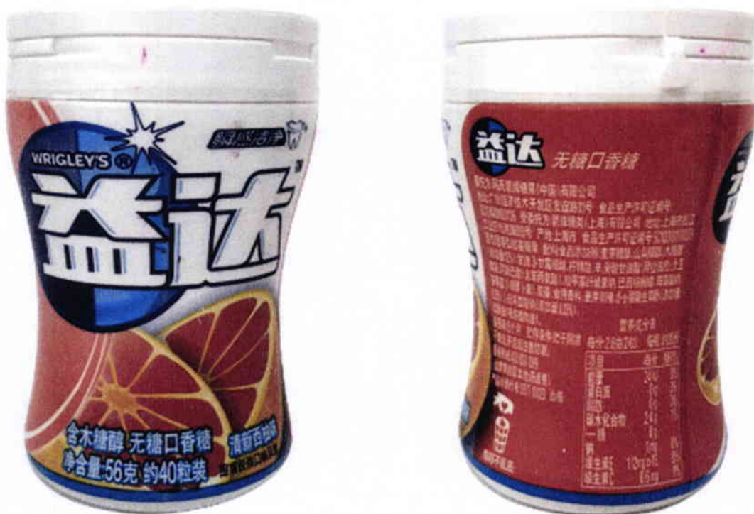
Figure 5. Unregistered WRIGLEY'S Food Product with Sliced Orange Image in Plastic Bottle (In Foreign Language)