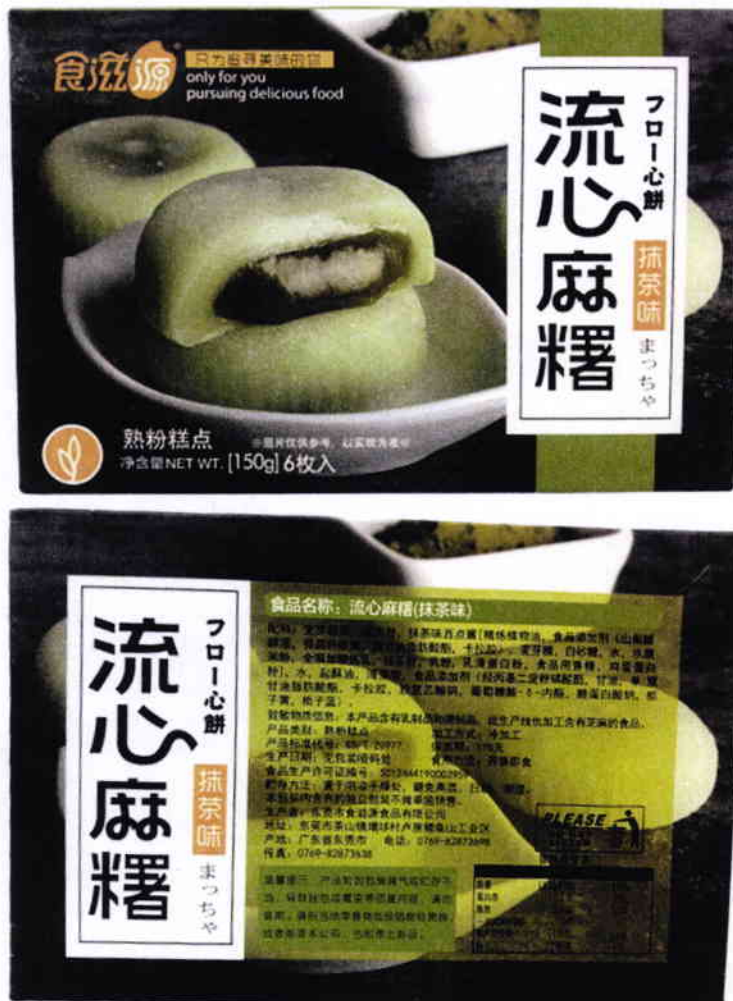
Figure 5. Unregistered ONLY FOR YOU PURSUING DELICIOUS FOOD Green Mochi-Like Food Product in Black and Green Box (In Foreign Language)