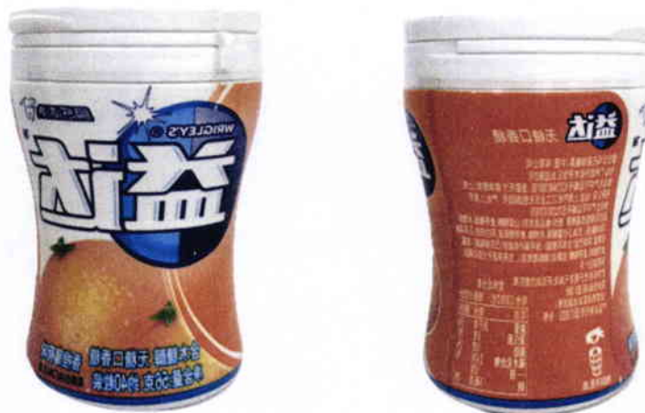
Figure 1. Unregistered WRIGLEY'S Food Product with Orange Image in Plastic Bottle (In Foreign Language)

The Food and Drug Administration (FDA) warns all healthcare professionals and the general public NOT TO PURCHASE AND CONSUME the following unregistered food products: