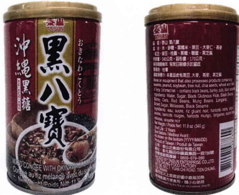
Figure 3. Unregistered TAISUN Mixed Congee with Okinawa Brown Sugar (In Foreign Language)