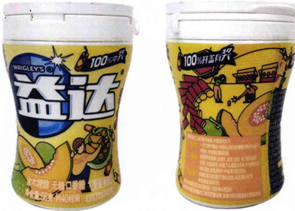
Figure 2. Unregistered WRIGLEY'S Food Product with Sliced Melon Image in Plastic Bottle (In Foreign Language)