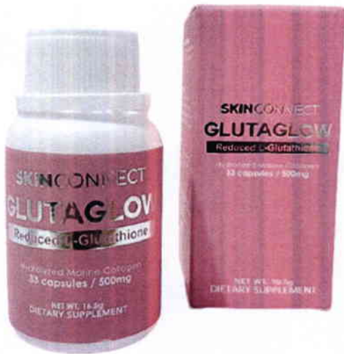
Figure 2. Unregistered SKINCONNECT Glutaglow Reduced L. Glutathione Dietary Supplement