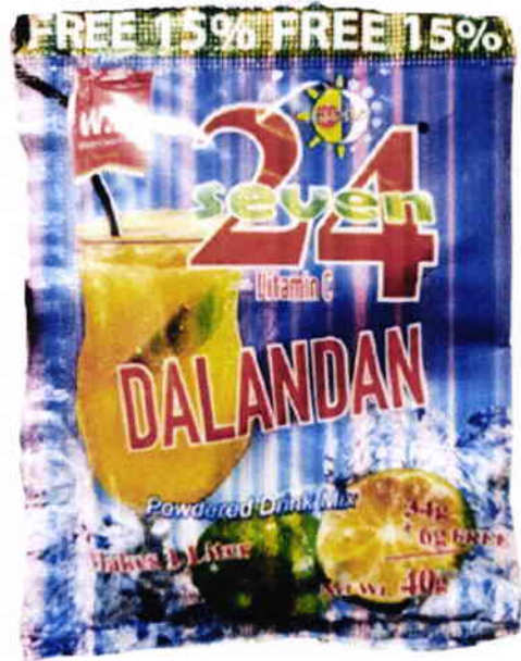
Figure 3. Unregistered W.L.24 Seven Dalandan Powdered Drink Mix