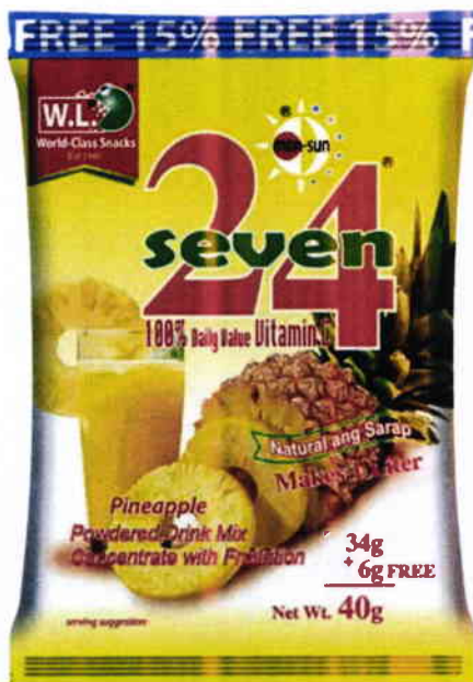
Figure 4. Unregistered W.L.24 Seven Pineapple Powdered Drink Mix