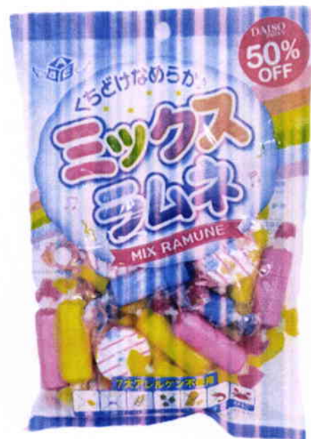
Figure 5. Unregistered MIX RAMUNE