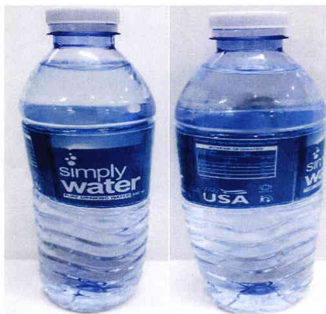
Figure 4. Unregistered SIMPLY WATER Pure Drinking Water, 500ml