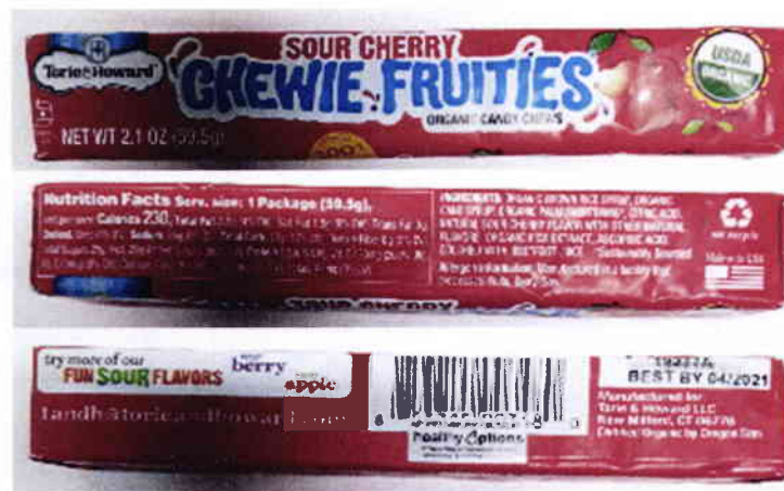
Figure 3. Unregistered TORIE&HOWARD CHEWIE FRUITIES Sour Cherry Organic Candy Chews, Net Wt. 59.5g (2.1oz)