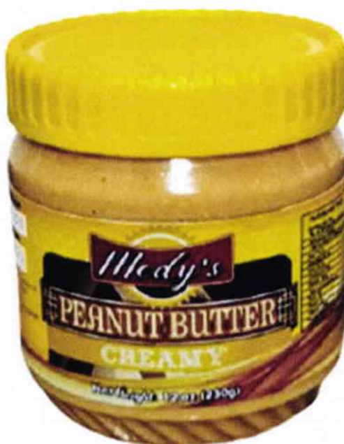
Figure 1. Unregistered MEDY'S Creamy Peanut Butter, Net Wt. 230g (12oz)

The Food and Drug Administration (FDA) warns all healthcare professionals and the general public NOT TO PURCHASE AND CONSUME the following unregistered food products: