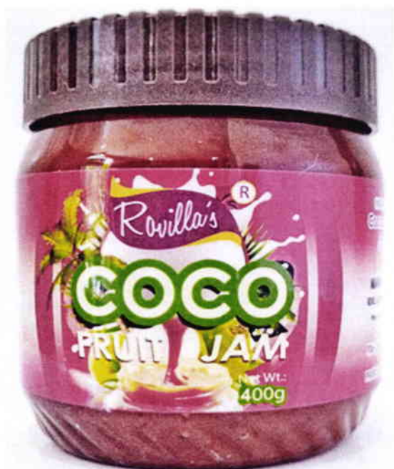
Figure 4. Unregistered ROVILLA'S Coco Fruit Jam, Net Wt. 400g