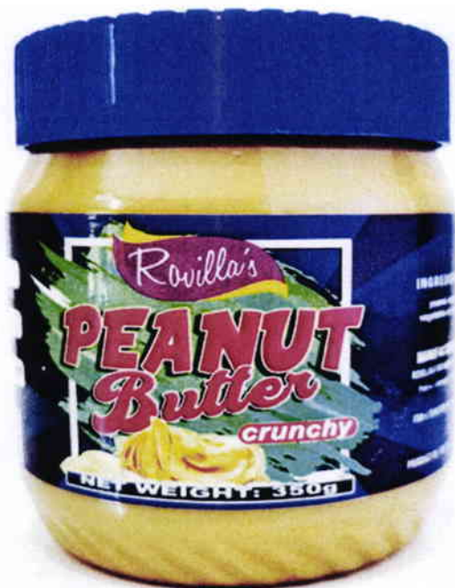
Figure 3. Unregistered ROVILLA'S Peanut Butter Crunchy, Net Wt. 250g