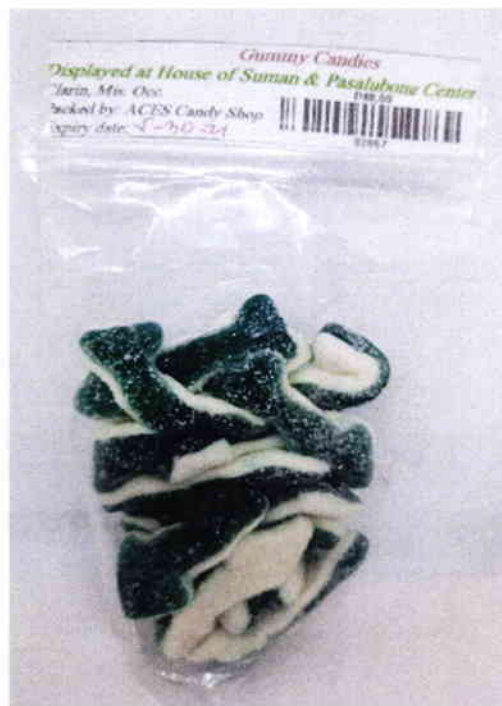
Figure 2. Unregistered (UNBRANDED) Gummy Candies – Shark Shaped