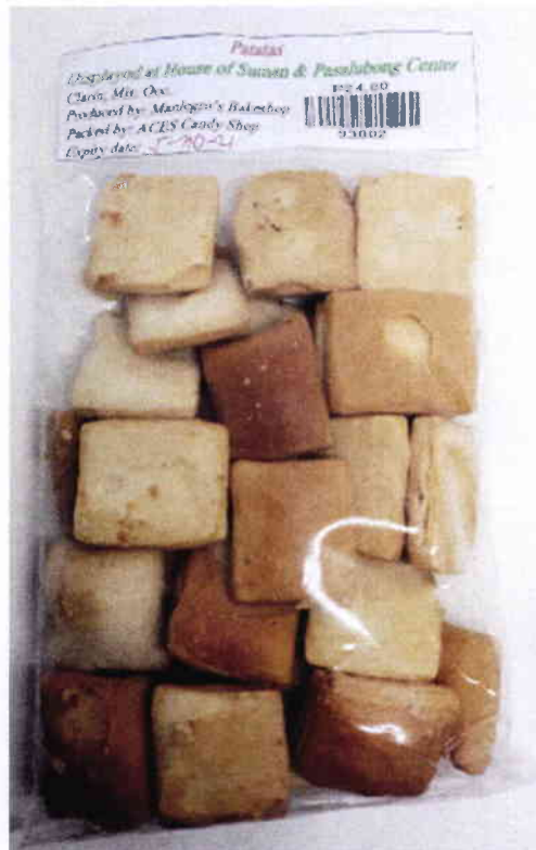
Figure 1. Unregistered (UNBRANDED) Patatas

The Food and Drug Administration (FDA) warns all healthcare professionals and the general public NOT TO PURCHASE AND CONSUME the following unregistered food products: