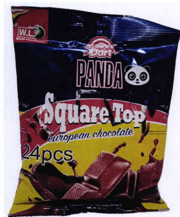
Figure 1. Unregistered W.L. SWEET DART Panda Square Top European Chocolate, Net Wt. 5g X 24Pcs = 108g

The Food and Drug Administration (FDA) warns all healthcare professionals and the general public NOT TO PURCHASE AND CONSUME the following unregistered food products: