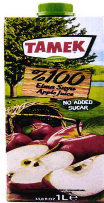
Figure 3. Unregistered TAMEK 100% Apple Juice, Net Wt. 1L (33.8Fl. Oz)