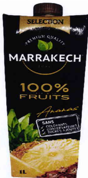
Figure 4. Unregistered MARRAKECH 100% Fruits Ananas Juice, Net Wt. 1L (33.8Fl. Oz)