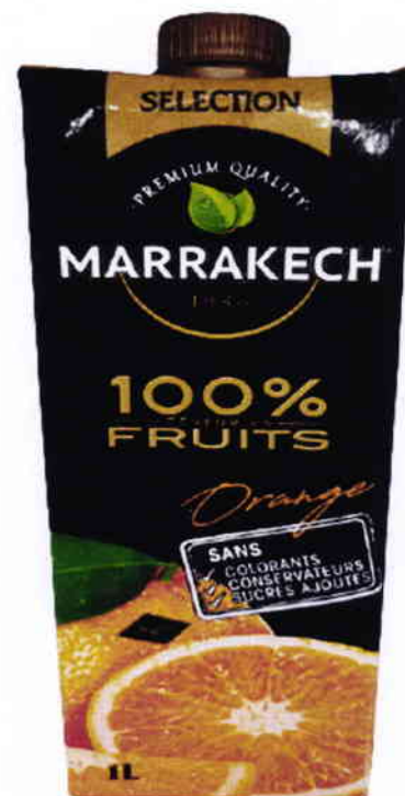
Figure 5. Unregistered MARRAKECH 100% Fruits Orange Juice, Net Wt. 1L (33.8Fl. Oz)