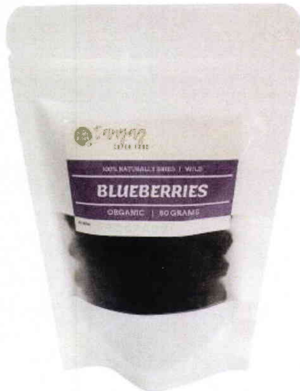
Figure 1. Unregistered THE PURE BITES 100% Naturally Dried Wild Blueberries

The Food and Drug Administration (FDA) warns all healthcare professionals and the general public NOT TO PURCHASE AND CONSUME the following unregistered food products and food supplement: