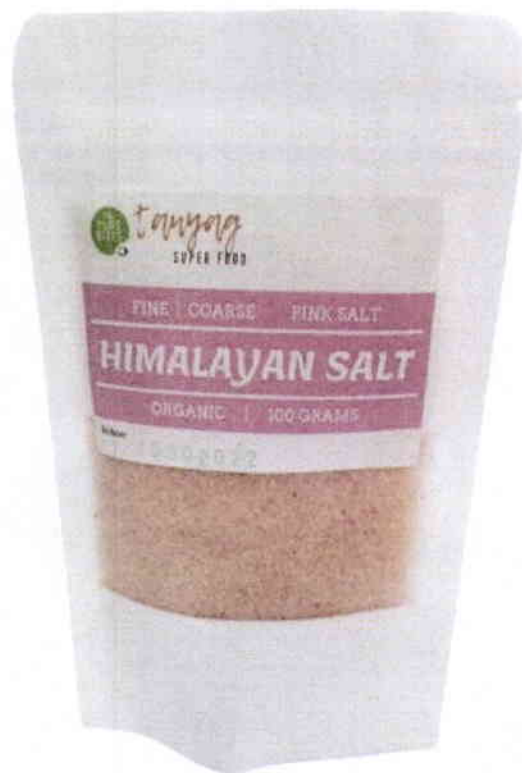
Figure 3. Unregistered THE PURE BITES Fine Coarse Pink Salt Himalayan Salt