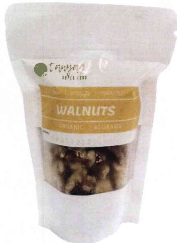
Figure 2. Unregistered THE PURE BITES Raw Shelled Walnuts