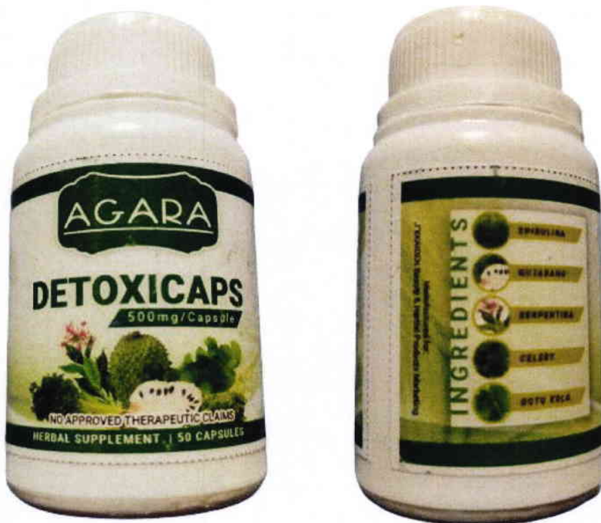
Figure 5. Unregistered AGARA DETOXICAPS Herbal Supplements