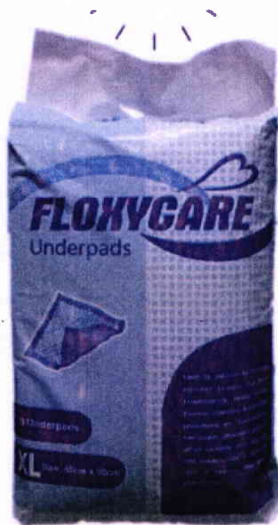
Figure 3. Unnotified Floxycare Underpads