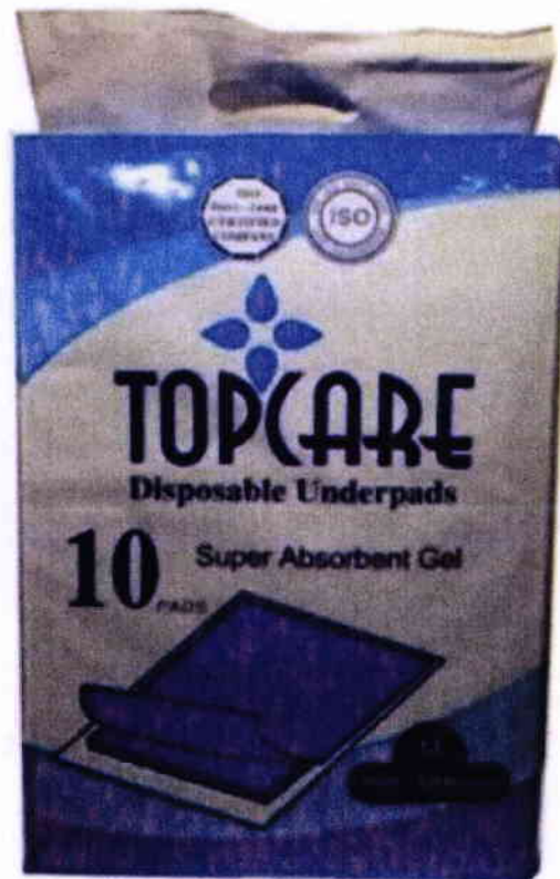
Figure 2. Unnotified Topcare Disposable Underpads