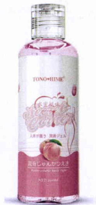
Figure 3. Unnotified Tonohime Flavored Water-Based Lubricant Blueberry