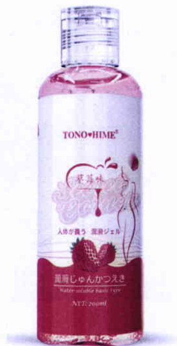
Figure 4. Unnotified Tonohime Flavored Water-Based Lubricant Strawberry