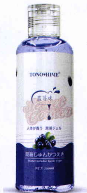
Figure 2. Unnotified Tonohime Flavored Water-Based Lubricant Blueberry