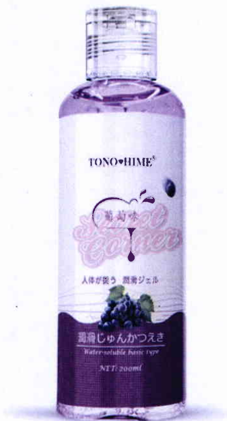
Figure 1. Unnotified Tonohime Flavored Water-Based Lubricant Grape

The Food and Drug Administration (FDA) warns all healthcare professionals and the general public NOT TO PURCHASE AND USE the following unnotified medical device products: