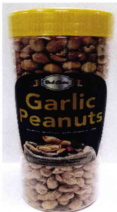
Figure 1. Unregistered BEST CHOICE Garlic Peanuts, 400g

The Food and Drug Administration (FDA) warns all healthcare professionals and the general public NOT TO PURCHASE AND CONSUME the following unregistered food products: