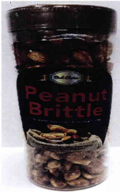
Figure 2. Unregistered BEST CHOICE Peanut Brittle, 400g