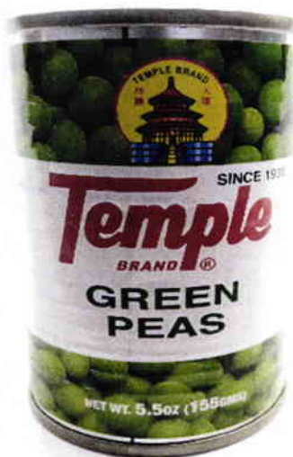
Figure 5. Unregistered TEMPLE BRAND Green Peas, Net Wt. 155gms (5.5oz)