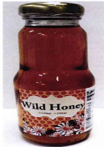
Figure 4. Unregistered (UNBRANDED) Wild Honey, 250ml