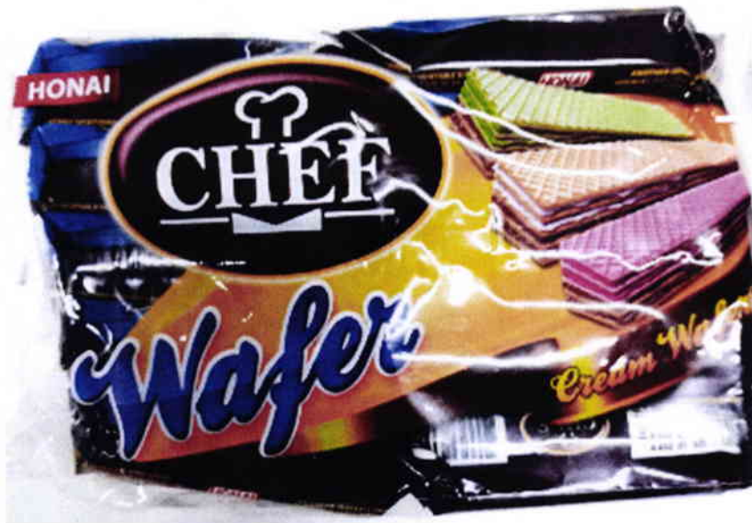
Figure 1. Unregistered HONAI CHEF Wafer, 10's X 15g

The Food and Drug Administration (FDA) warns all healthcare professionals and the general public NOT TO PURCHASE AND CONSUME the following unregistered food products: