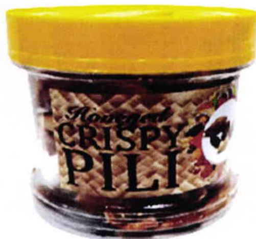
Figure 5. Unregistered JC Honeyed Crisp Pili - Big