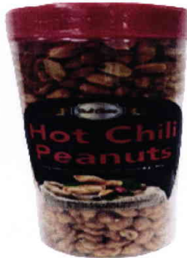
Figure 4. Unregistered BEST CHOICE Hot Chili Peanuts, 400g