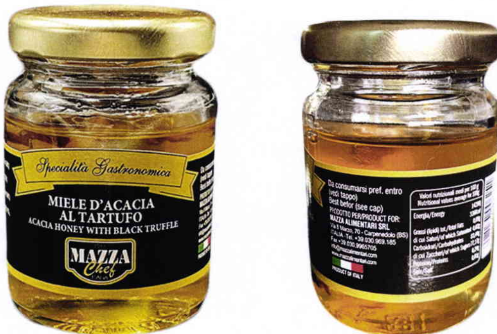
Figure 1. Unregistered MAZZA Acacia Honey with Black Truffle (In Foreign Language)

The Food and Drug Administration (FDA) warns all healthcare professionals and the general public NOT TO PURCHASE AND CONSUME the following unregistered food products: