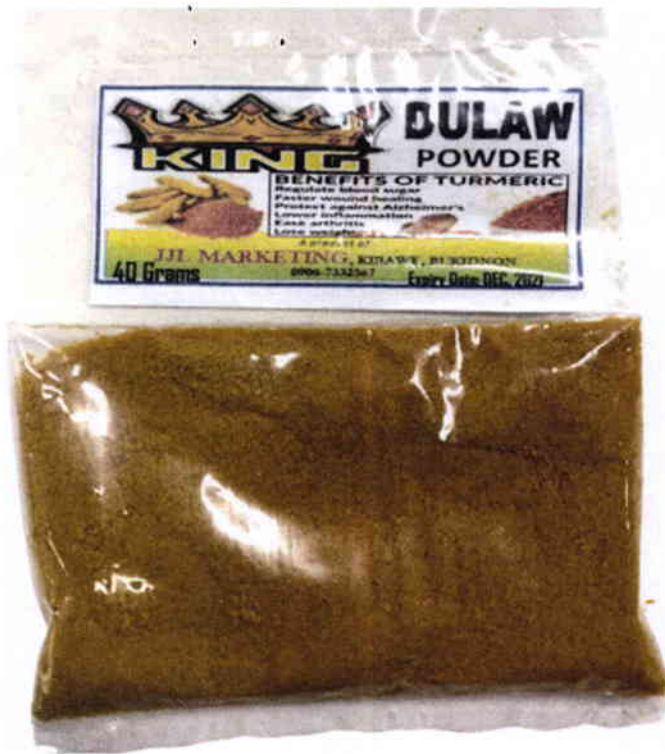
Figure 2. Unregistered KING Dulaw Powder