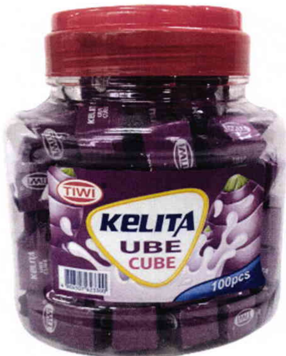
Figure 4. Unregistered TIWI Kelita Ube Cube