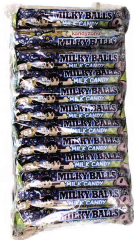
Figure 5. Unregistered KANDYZONE Milky Balls Milk Candy