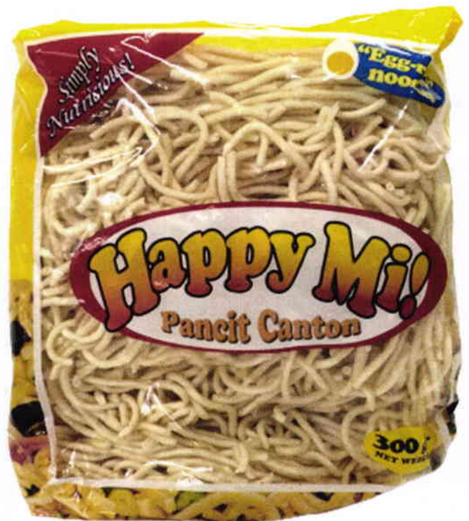
Figure 3. Unregistered HAPPY MI! Pancit Canton