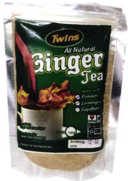
Figure 3. Unregistered TWINS All Natural Ginger Tea