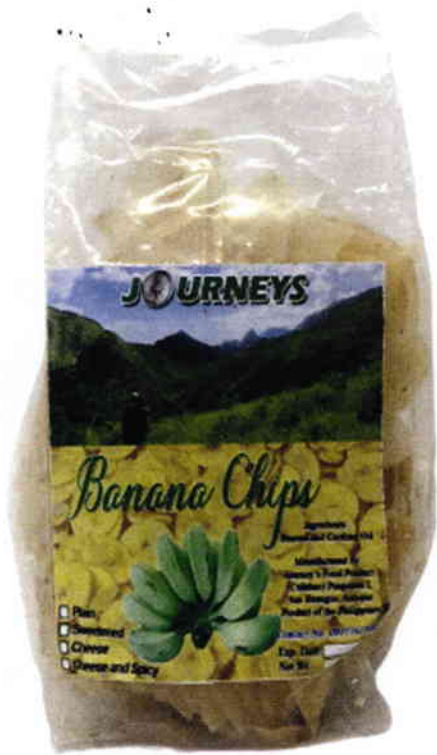
Figure 2. Unregistered JOURNEYS Banana Chips