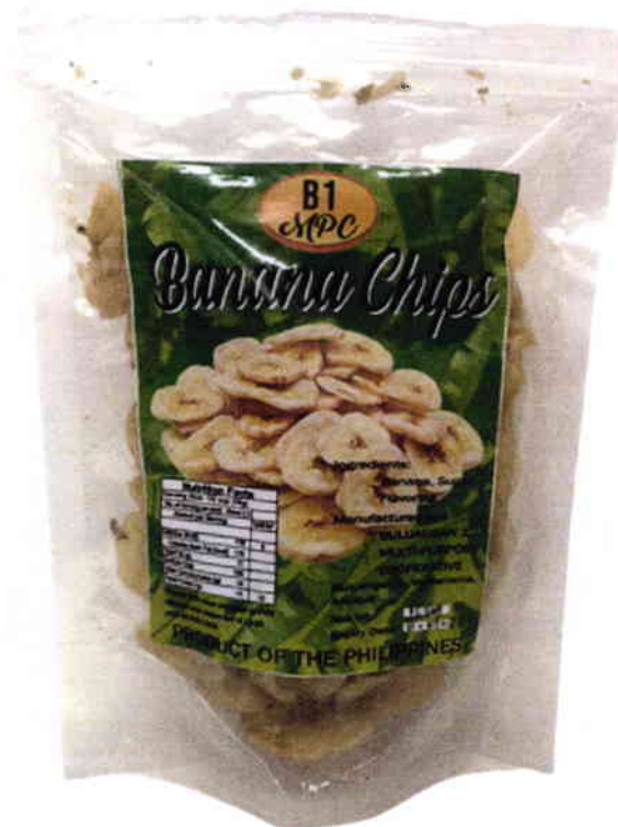
Figure 4. Unregistered B1 MPC Banana Chips