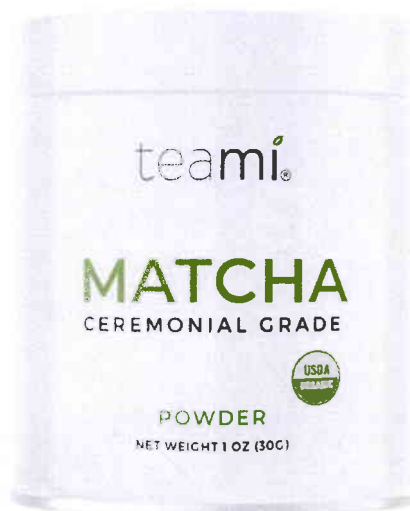
Figure 1. Unregistered TEAMI Matcha Ceremonial Grade Powder

The Food and Drug Administration (FDA) warns all healthcare professionals and the general public NOT TO PURCHASE AND CONSUME the following unregistered food products and food supplement: