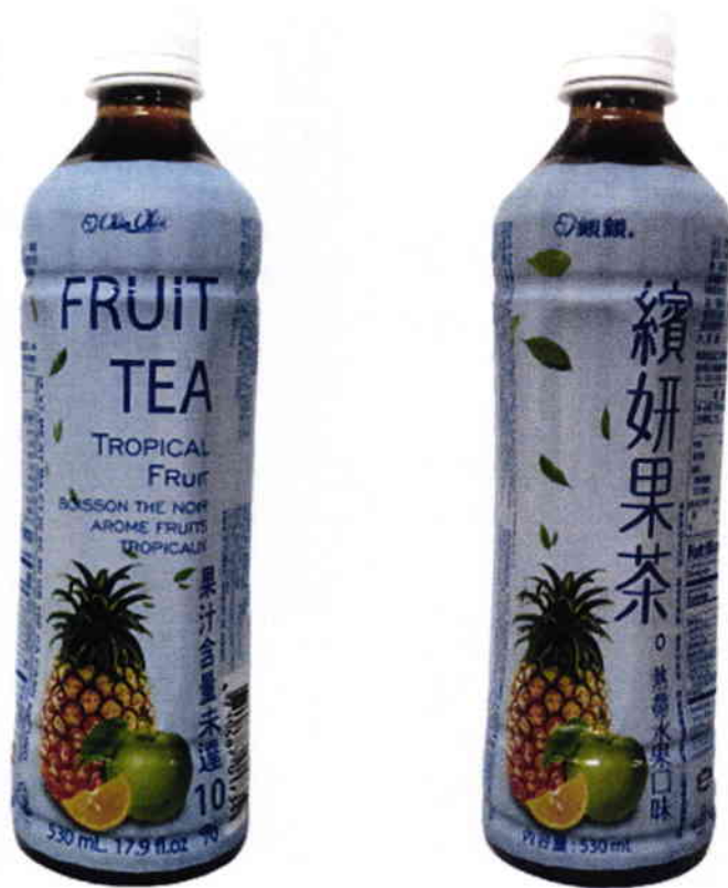
Figure 4. Unregistered CHIN CHIN Fruit Tea Tropical Fruit (In Foreign Language)