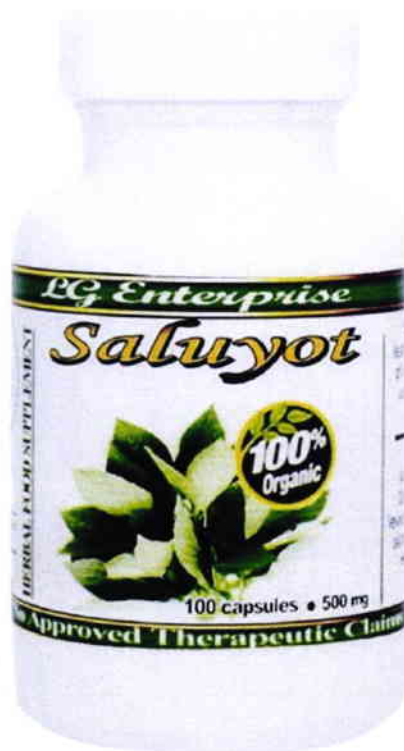
Figure 5. Unregistered LG ENTERPRISE Saluyot