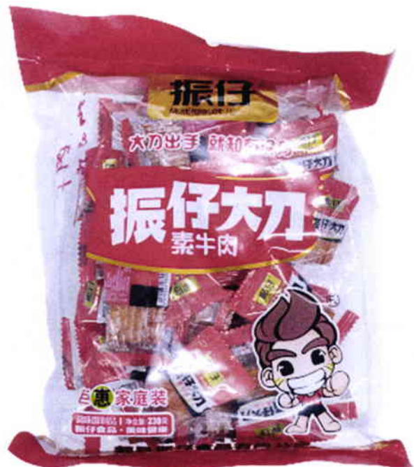
Figure 3. Unregistered Assumed as Preserved Meat Individually Packed in a Red and Clear Plastic Packaging (In Foreign Language)