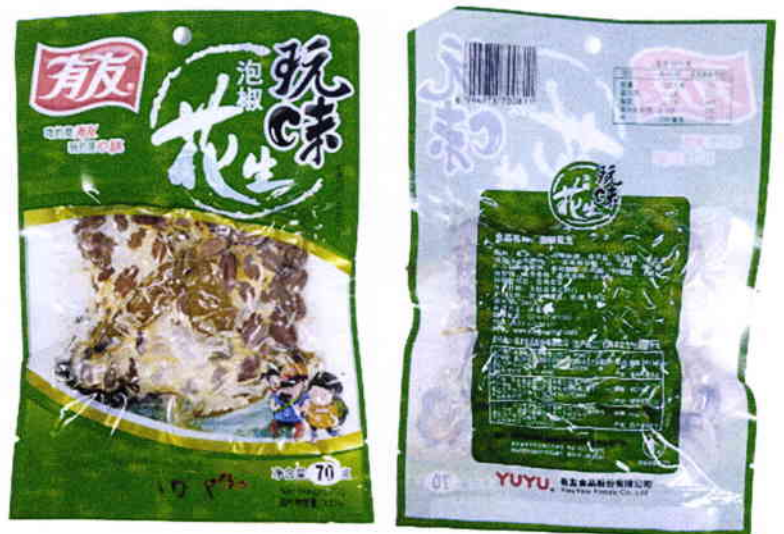
Figure 5. Unregistered YUYU Assumed as Peanuts in a Green Vacuum Sealed Plastic (In Foreign Language)