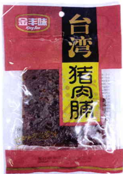
Figure 4. Unregistered Assumed Food Product in Transparent Violet Vacuum Sealed Plastic (In Foreign Language)