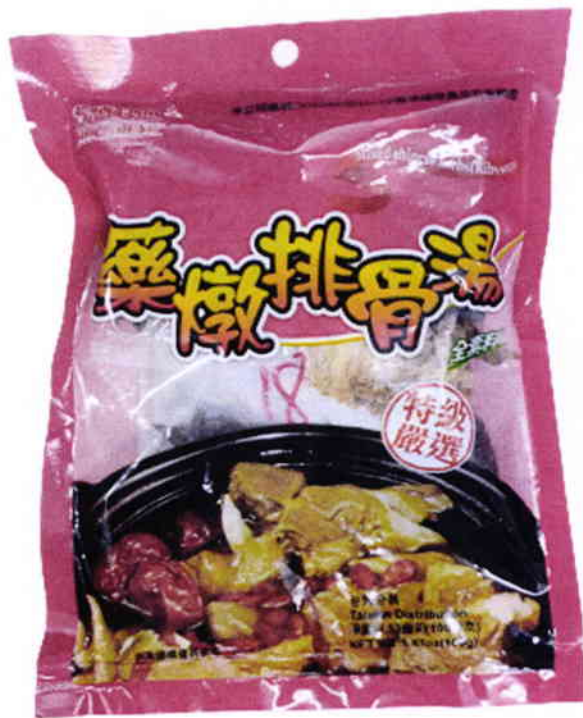
Figure 2. Unregistered CHI SHENG Mixed Chinese Herbs (Ribs Soup) In Pink Plastic Packaging (In Foreign Language)