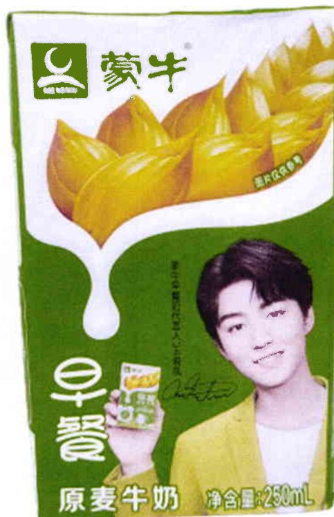
Figure 3. Unregistered Assumed Drink in Green Paper Carton (In Foreign Language)