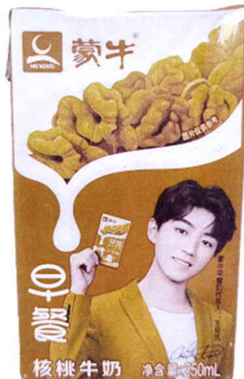
Figure 1. Unregistered MENGNUI Drink in Brown Box Carton (In Foreign Language)

The Food and Drug Administration (FDA) warns all healthcare professionals and the general public NOT TO PURCHASE AND CONSUME the following unregistered food products: