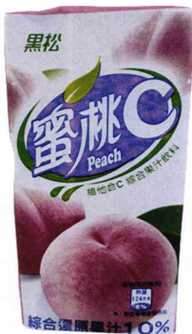
Figure 4. Unregistered Peach Drink in Pink Carton Box (In Foreign Language)