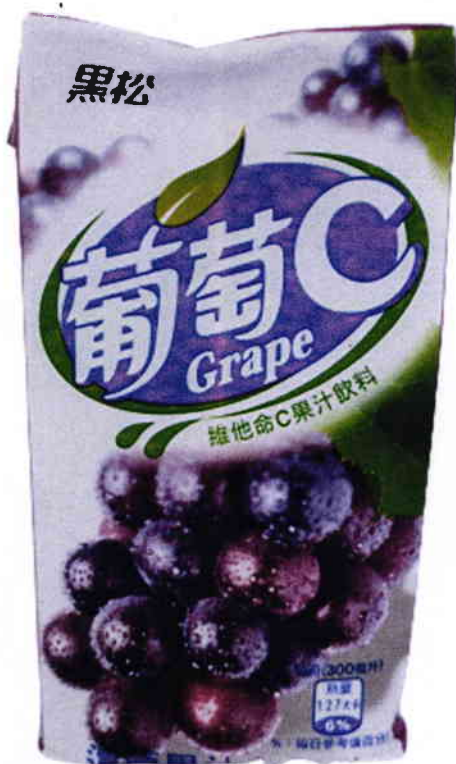
Figure 2. Unregistered Grape Drink in Violet White Carton Box (In Foreign Language)