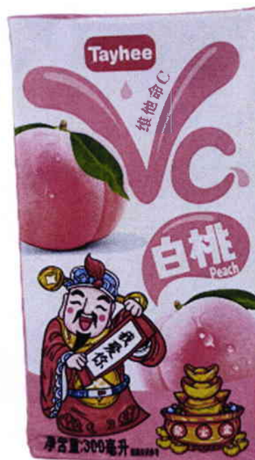
Figure 5. Unregistered TAYHEE Peach in Pink Carton Box (In Foreign Language)