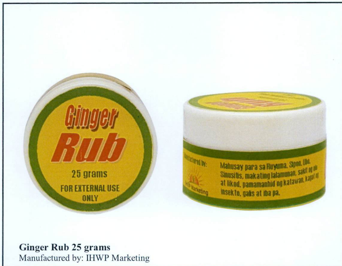
Ginger Rub 25 grams Manufactured by: IHWP Marketing

The Food and Drug Administration (FDA) advises the public against the purchase and use of the following unregistered drug products: