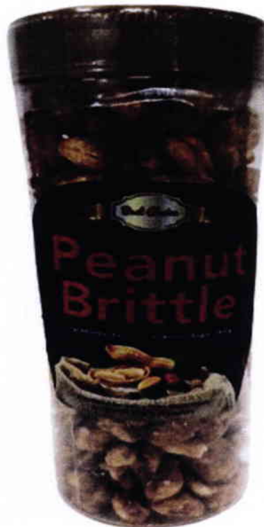
Figure 1. The Approved label of BEST CHOICE Peanut Brittle with registration number FR- 400008333159 valid until 06 September 2026 .

The Food and Drug Administration (FDA) informs the public that the following food products are now registered by the Market Authorization Holder (MAH) COLE'S PINOY SWEET TREATS in accordance to existing FDA rules and regulations.