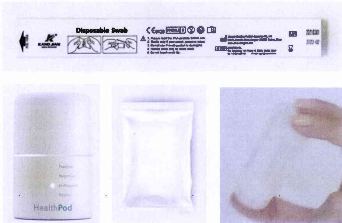
Figure 1. Uncertified Circle Health Pod Set

The Food and Drug Administration (FDA) warns all healthcare professionals and the general public NOT TO PURCHASE AND USE the uncertified Covid-19 test kit: