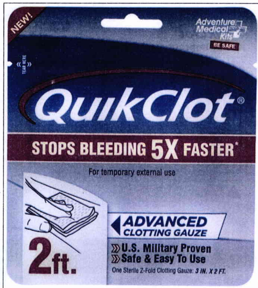
Figure 1. Unnotified QuikClot® Advance Clotting Gauze

The Food and Drug Administration (FDA) warns all healthcare professionals and the general public NOT TO PURCHASE AND USE the unnotified medical device product: