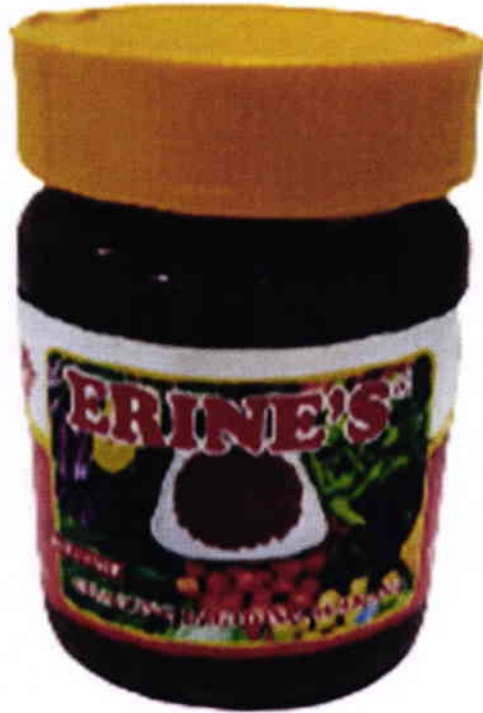
Figure 2. Unregistered ERINE'S Hot & Spicy Gisadong Bagoong Alamang, Net Wt. 260g