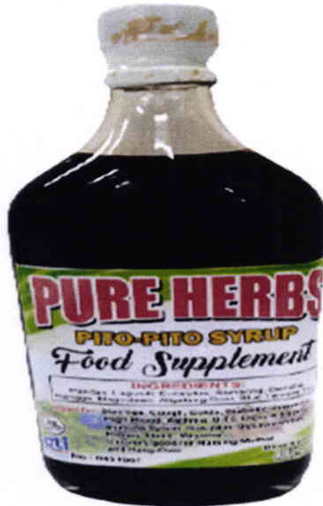
Figure 3. Unregistered PURE HERBS Pito-Pito Syrup Food Supplement, 375ml