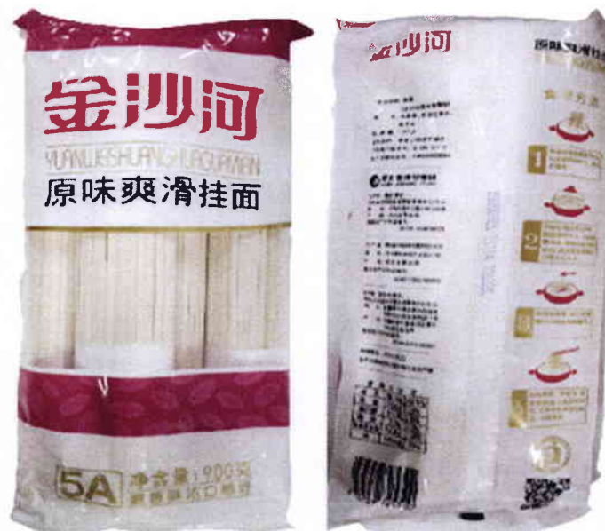
Figure 1. Unregistered YUANWEISHUANGHUAGUAMIAN (Noodle like product in clear plastic pouch with white and pink label) (Labels are in foreign characters)

The Food and Drug Administration (FDA) warns all healthcare professionals and the general public NOT TO PURCHASE AND CONSUME the following unregistered food products and food supplement: