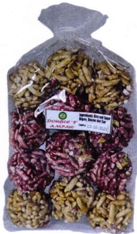
Figure 1. Unregistered DOUBLE S Ampaw

The Food and Drug Administration (FDA) warns all healthcare professionals and the general public NOT TO PURCHASE AND CONSUME the following unregistered food products and food supplements: