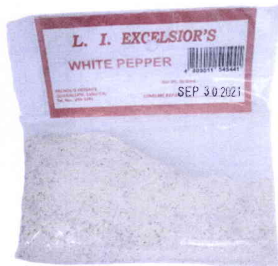
Figure 3. Unregistered L.I. EXCELSIOR'S White Pepper