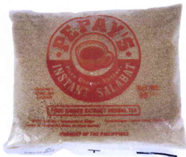
Figure 5. Unregistered PEPAY'S Instant Salabat Pure Ginger Extract Herbal Tea