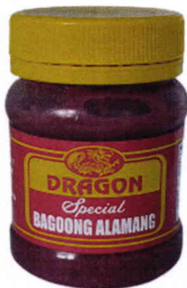
Figure 4. Unregistered DRAGON Special Bagoong Alamang