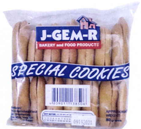
Figure 5. Unregistered J-GEM-R BAKERY AND FOOD PRODUCTS Special Cookies