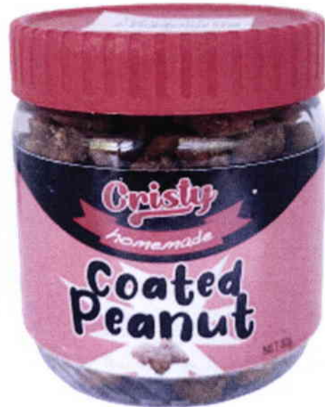
Figure 3. Unregistered CRISTY Homemade Coated Peanut