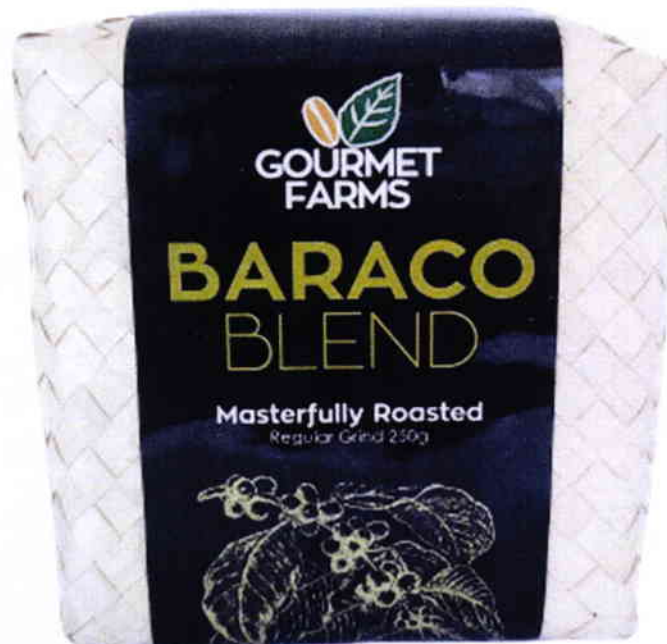
Figure 1. Unregistered GOURMET FARMS Baraco Blend Regular Grind Coffee

The Food and Drug Administration (FDA) warns all healthcare professionals and the general public NOT TO PURCHASE AND CONSUME the following unregistered food products: