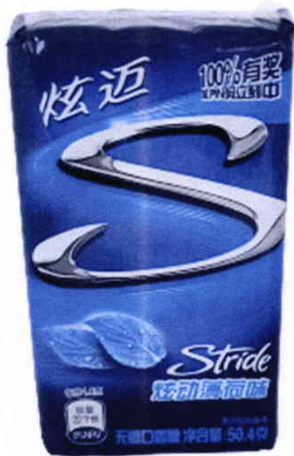
Figure 2. Unregistered STRIDE in Blue Packaging with Image of Blue Leaf (In Foreign Language)