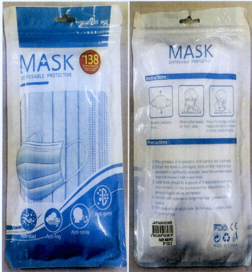
Figure 1. Unnotified MASK DISPOSABLE PROTECTIVE

The Food and Drug Administration (FDA) warns all healthcare professionals and the general public NOT TO PURCHASE AND USE the unnotified medical device product: