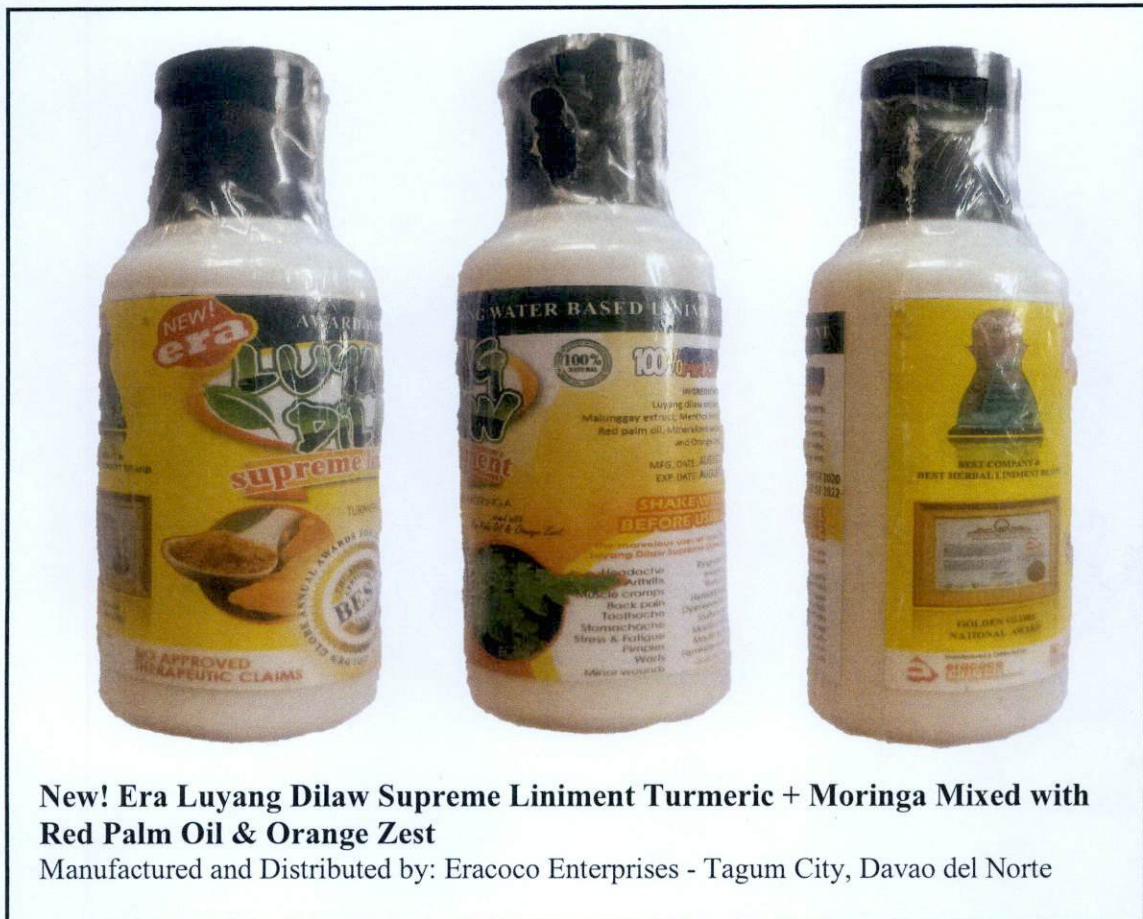
Figure 1. Unregistered drug product

The Food and Drug Administration (FDA) advises the public against the purchase and use of the following unregistered drug products: