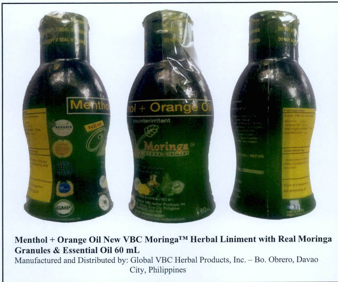
Figure 2. Unregistered drug product

FDA Post-Marketing Surveillance (PMS) activities have verified that the abovementioned drug products have not gone through the registration process of the Agency and have not been issued with proper authorization in the form of Certificate of Product Registration. Thus, the Agency cannot guarantee their quality, safety and efficacy. Therefore, consumption of such violative products may pose potential danger or injury to health.