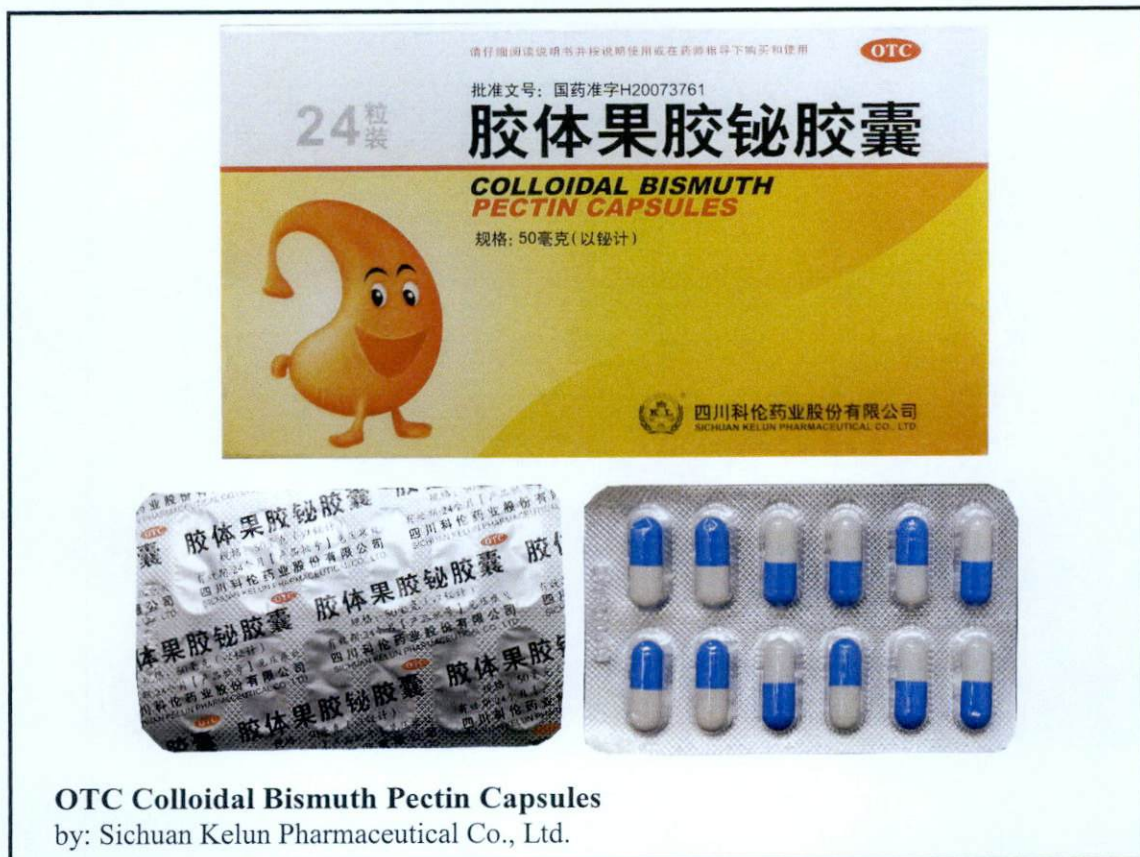
OTC Colloidal Bismuth Pectin Capsules by: Sichuan Kelun Pharmaceutical Co., Ltd.

The Food and Drug Administration (FDA) advises the public against the purchase and use of the following unregistered drug products: