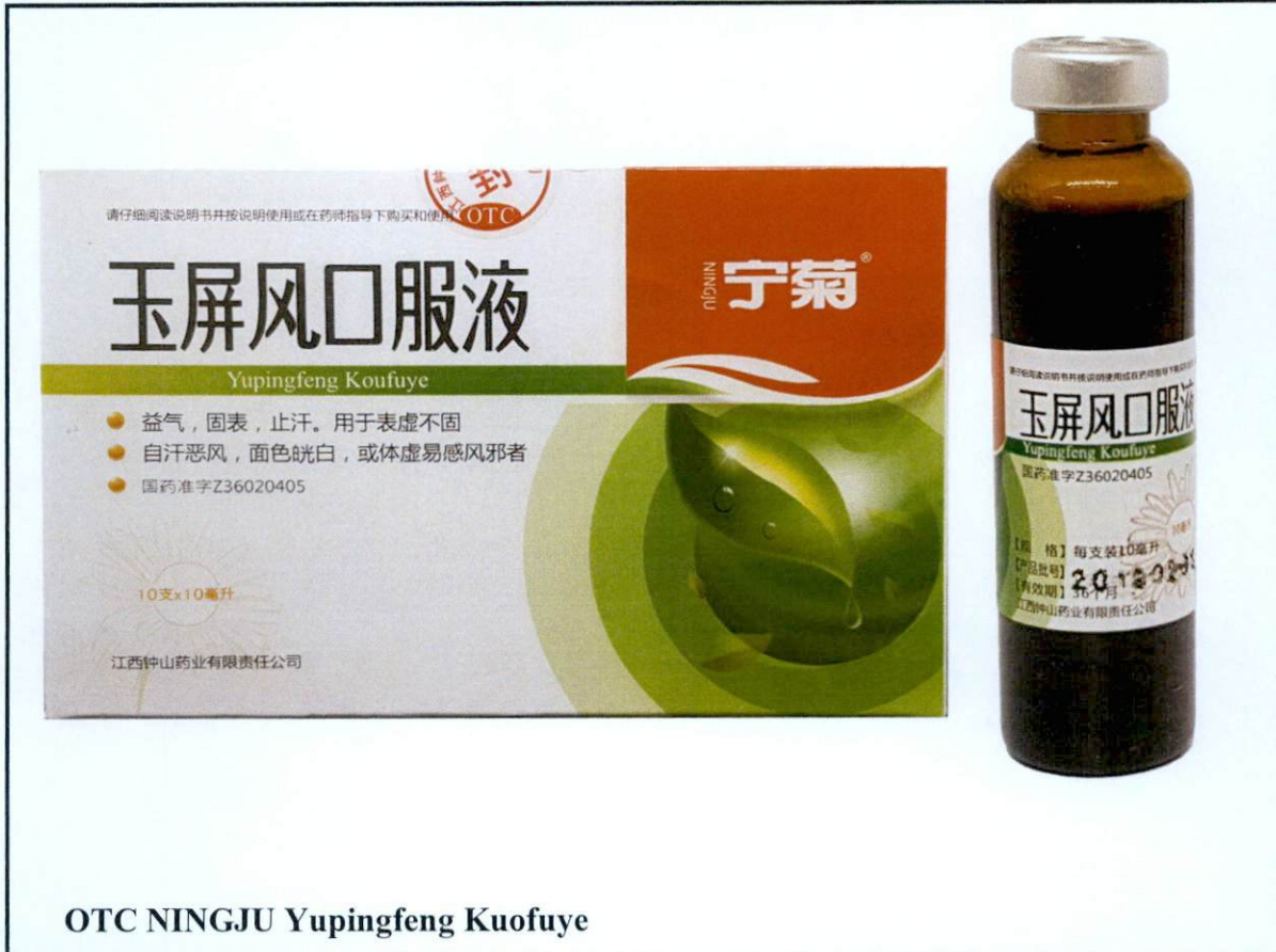
Figure 3. Unregistered drug product