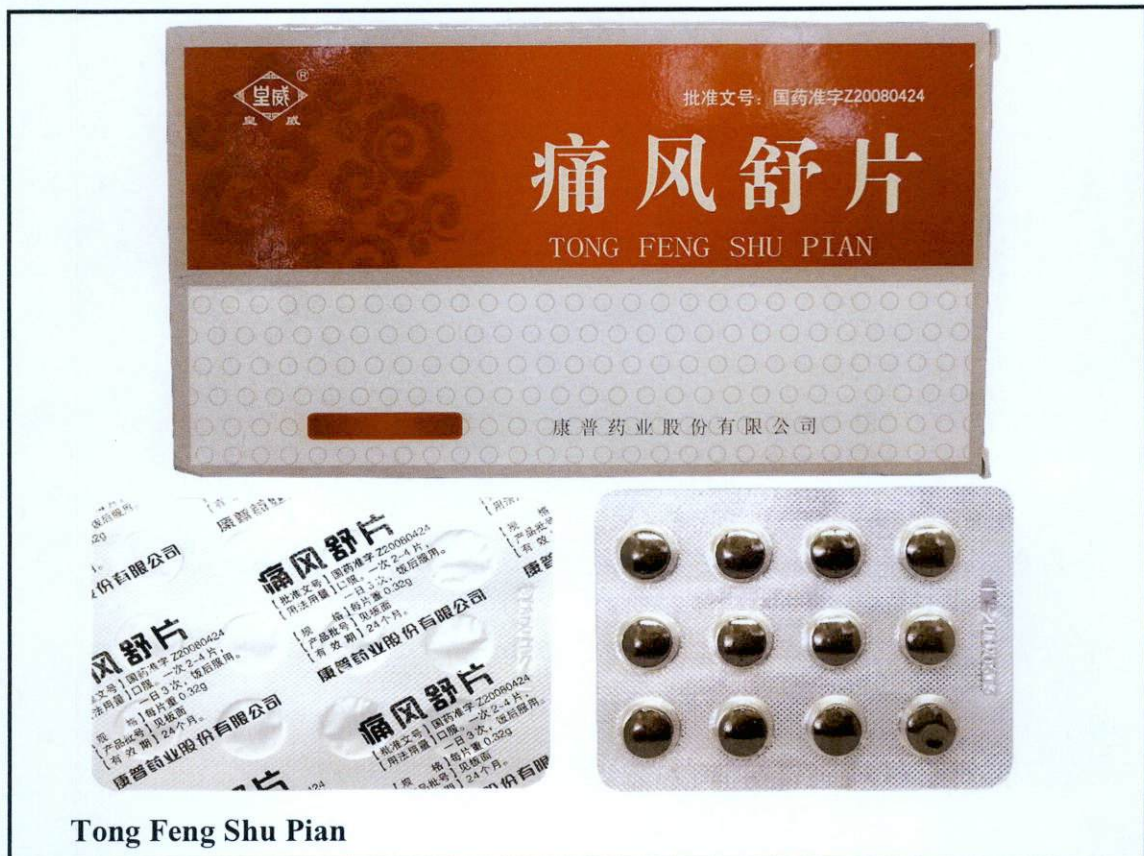
Tong Feng Shu Pian

The Food and Drug Administration (FDA) advises the public against the purchase and use of the following unregistered drug products: