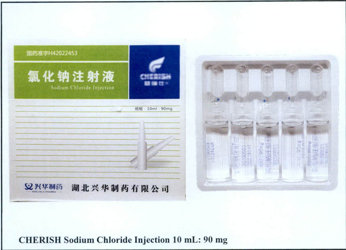
CHERISH Sodium Chloride Injection 10 mL: 90 mg