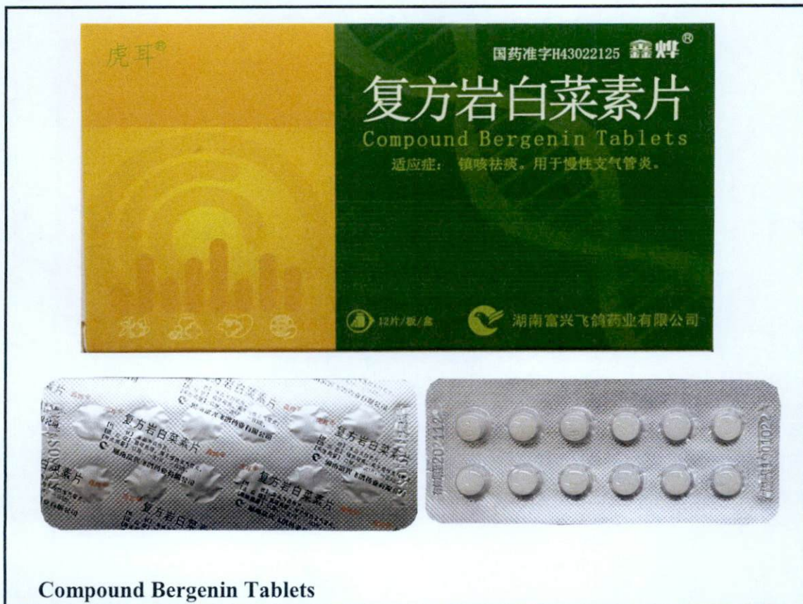
Compound Bergenin Tablets

The Food and Drug Administration (FDA) advises the public against the purchase and use of the following unregistered drug products: