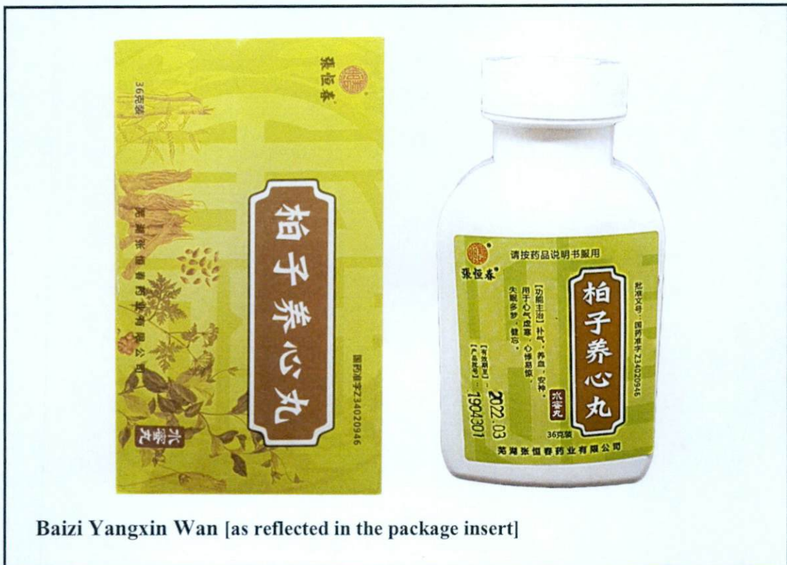
Baizi Yangxin Wan [as reflected in the package insert]

The Food and Drug Administration (FDA) advises the public against the purchase and use of the following unregistered drug products: