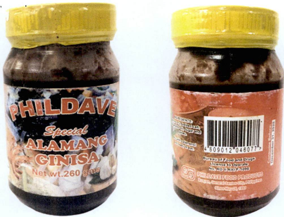
Figure 4. Unregistered PHILDAVE Special Alamang Ginisa