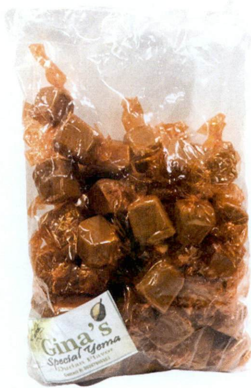
Figure 2. Unregistered GINA'S Special Yema Durian Flavor