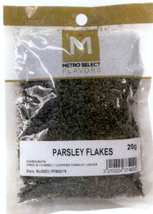
Figure 5. Unregistered METRO SELECT FLAVORS Parsley Flakes