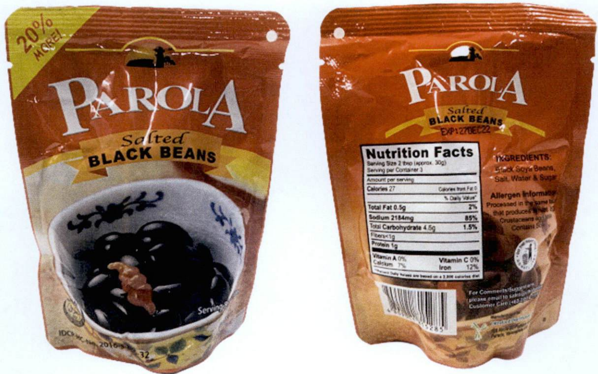
Figure 3. Unregistered PAROLA Salted Black Beans