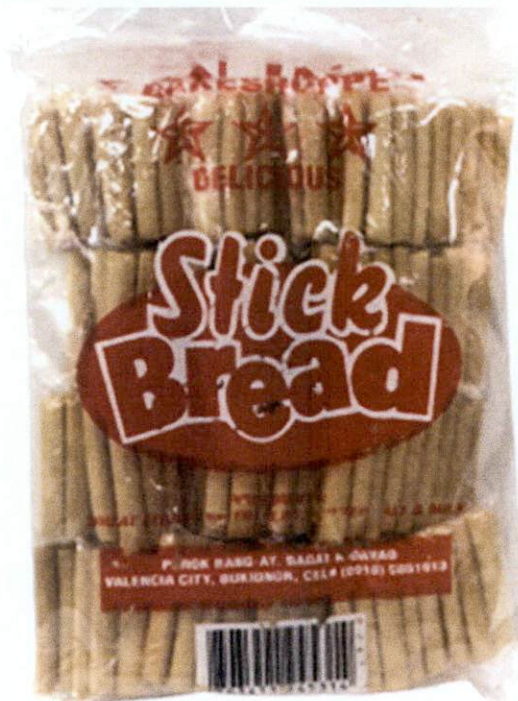
Figure 1. Unregistered NEW IMAR BAKESHOPPE Stick Bread

The Food and Drug Administration (FDA) warns all healthcare professionals and the general public NOT TO PURCHASE AND CONSUME the following unregistered food products: