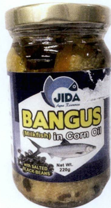
Figure 4. Unregistered JIDA AQUA RESOURCES Bangus (Milkfish) in Corn Oil with Salted Black Beans