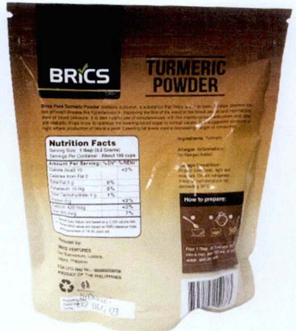
Figure 2. Unregistered BRICS Turmeric Powder