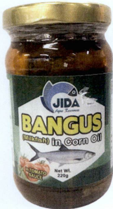
Figure 3. Unregistered JIDA AQUA RESOURCES Bangus (Milkfish) in Corn Oil in Tomato Sauce