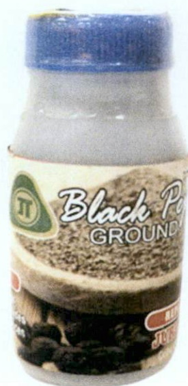
Figure 1. Unregistered JT Black Pepper Ground

The Food and Drug Administration (FDA) warns all healthcare professionals and the general public NOT TO PURCHASE AND CONSUME the following unregistered food products: