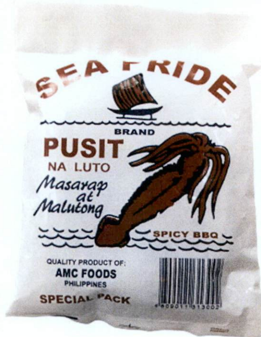
Figure 1. Unregistered SEA PRIDE BRAND Pusit na Luto Spicy BBQ

The Food and Drug Administration (FDA) warns all healthcare professionals and the general public NOT TO PURCHASE AND CONSUME the following unregistered food products: