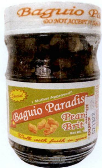
Figure 3. Unregistered BAGUIO PARADISE Peanut Brittle