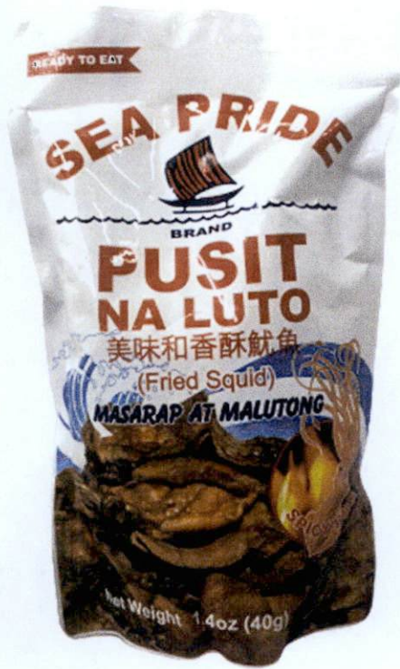
Figure 2. SEA PRIDE BRAND Pusit na Luto (Fried Squid) Spicy BBQ