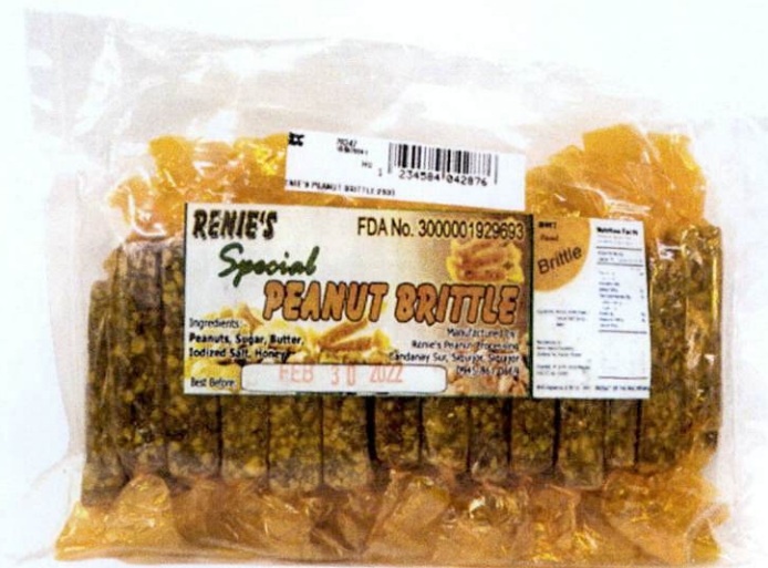
Figure 4. Unregistered RENIE'S Special Peanut Brittle