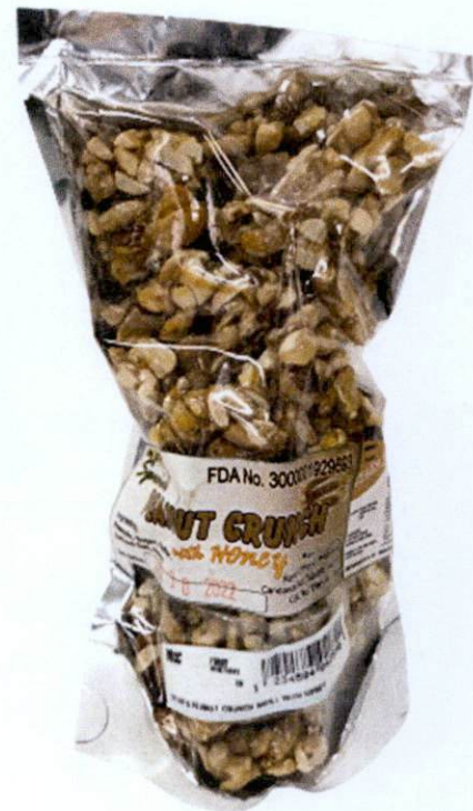
Figure 5. Unregistered RENIE'S Special Peanut Crunch with Honey