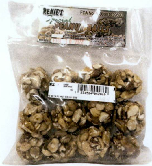
Figure 2. RENIE'S Special Peanut Balls