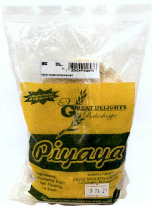
Figure 4. Unregistered GREAT DELIGHTS BAKESHOPPE Piyaya