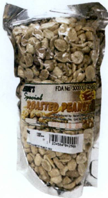
Figure 1. Unregistered RENIE'S Special Roasted Peanut

The Food and Drug Administration (FDA) warns all healthcare professionals and the general public NOT TO PURCHASE AND CONSUME the following unregistered food products: