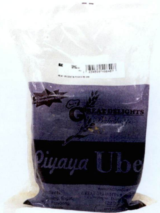
Figure 3. Unregistered GREAT DELIGHTS BAKESHOPPE Piyaya Ube