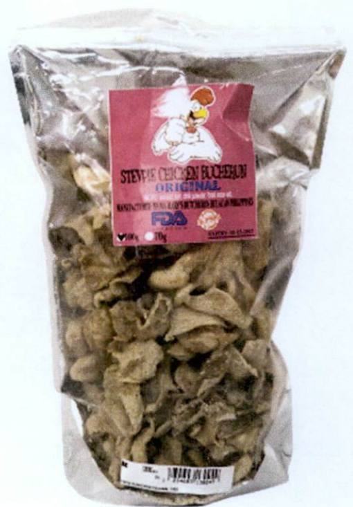
Figure 5. Unregistered STEVPIE Chicken Bucherun Original