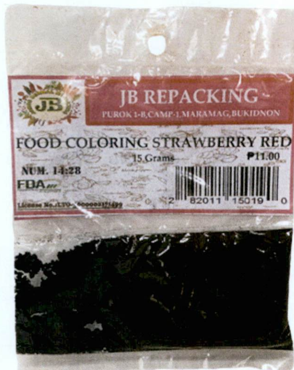
Figure 3. Unregistered JB REPACKING Food Coloring Strawberry Red