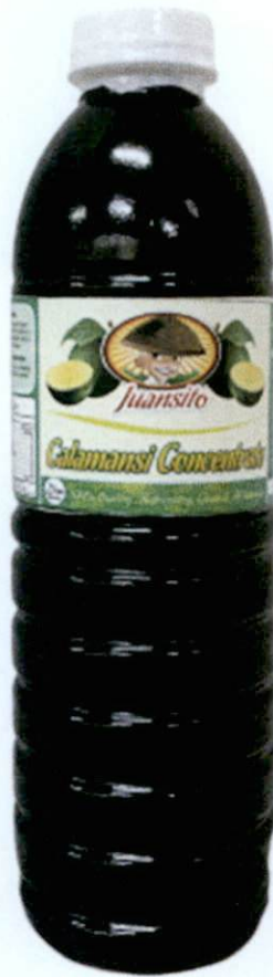
Figure 2. Unregistered JUANSITO Calamansi Concentrate