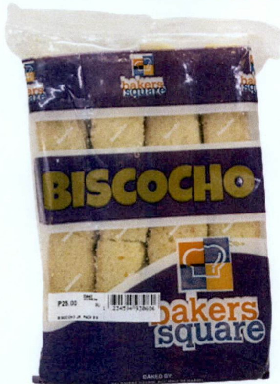
Figure 1. Unregistered BAKERS SQUARE Biscocho

The Food and Drug Administration (FDA) warns all healthcare professionals and the general public NOT TO PURCHASE AND CONSUME the following unregistered food products: