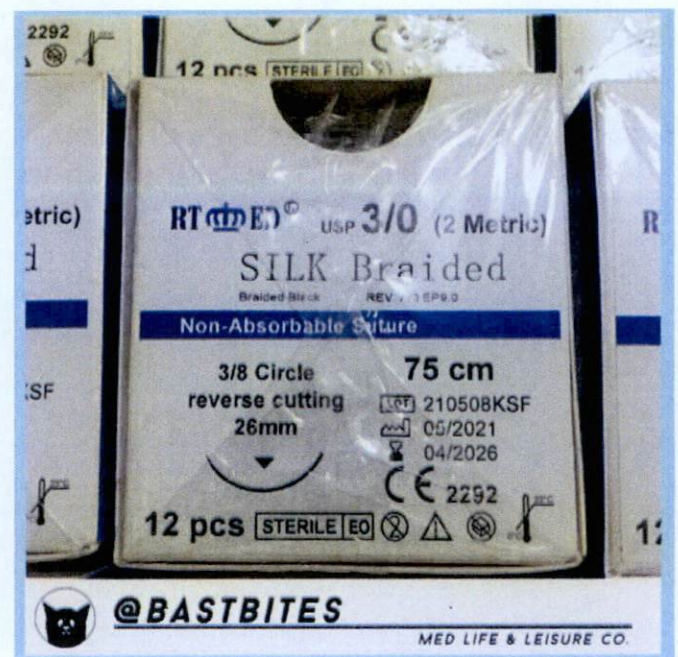
Figure 1. Unregistered RT ED Surgical Suture 3/8 circle, reverse cutting, 26mm (Silk Braided, Braided Black, Non-Absorbable Suture)