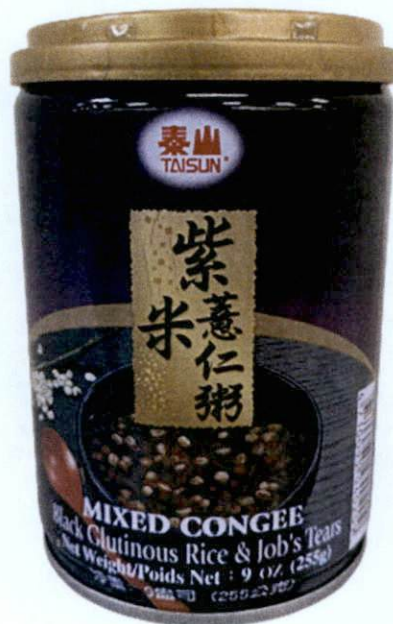
Figure 1. Unregistered TAISUN Mixed Congee Black Glutinous Rice & Job's Tears. 255 g (Labels are in foreign characters)

The Food and Drug Administration (FDA) warns all healthcare professionals and the general public NOT TO PURCHASE AND CONSUME the following unregistered food products: