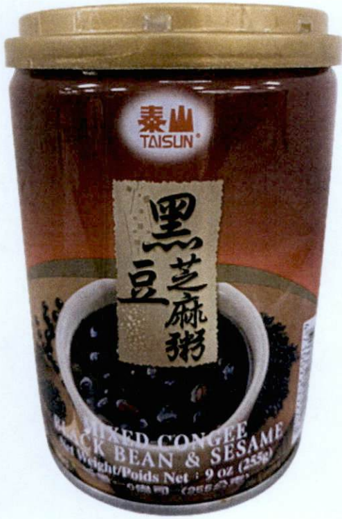
Figure 2. Unregistered TAISUN Mixed Congee Black Bean & Sesame, 255 g (Labels are in foreign characters)