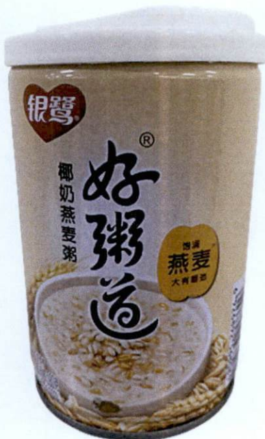
Figure 4. Unregistered Cream-colored Tin Can with image of Rice Porridge (Labels are in foreign characters)