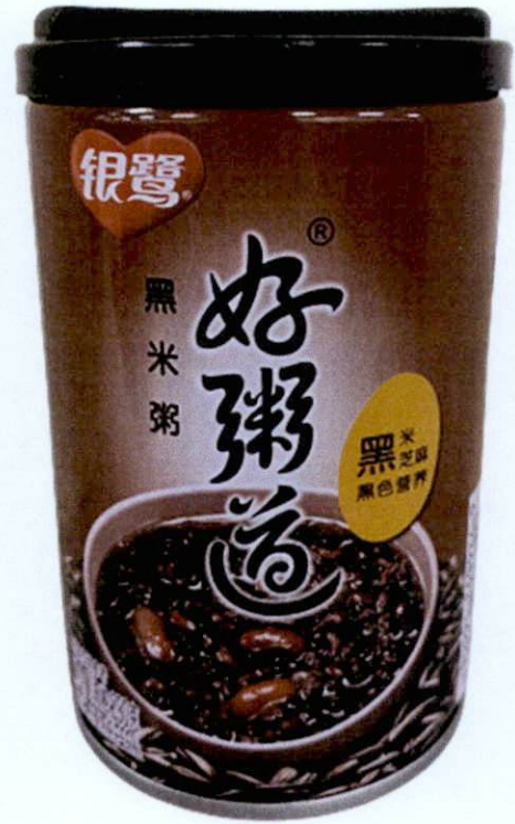
Figure 3. Unregistered Brown-colored Tin Can with image of Black Rice (Labels are in foreign characters)