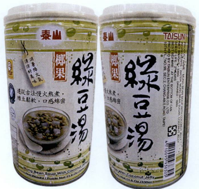
Figure 5. Unregistered TAISUN Mung Bean Soup with Coconut Jelly (Labels are in foreign characters)