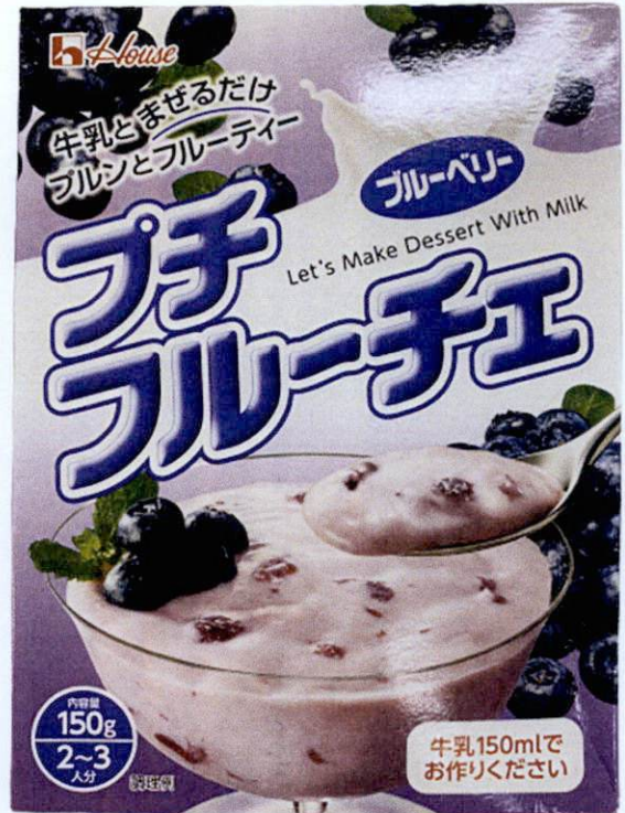
Figure 3. Unregistered HOUSE Let's Make Dessert with Milk, 150 g (Labels are in foreign characters)