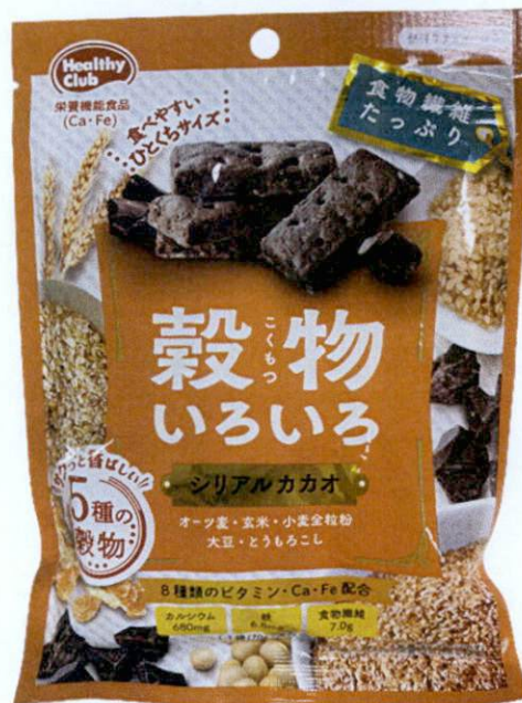
Figure 1. Unregistered HEALTHY CLUB Ca-Fe in a Orange-colored pouch with images of Brownie and Grains (Labels are in foreign characters)

The Food and Drug Administration (FDA) warns all healthcare professionals and the general public NOT TO PURCHASE AND CONSUME the following unregistered food products: