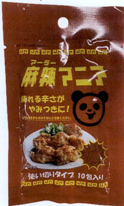
Figure 2. Unregistered Red-colored Pouch with image of Chicken sprinkled with Red-colored powder (Labels are in foreign characters)