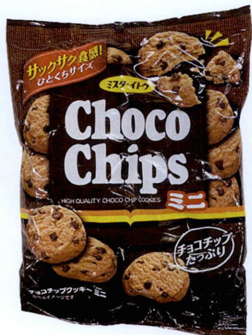
Figure 5. Unregistered Choco Chips High Quality Choco Chip Cookies in a Brown-colored plastic pouch (Labels are in foreign characters)