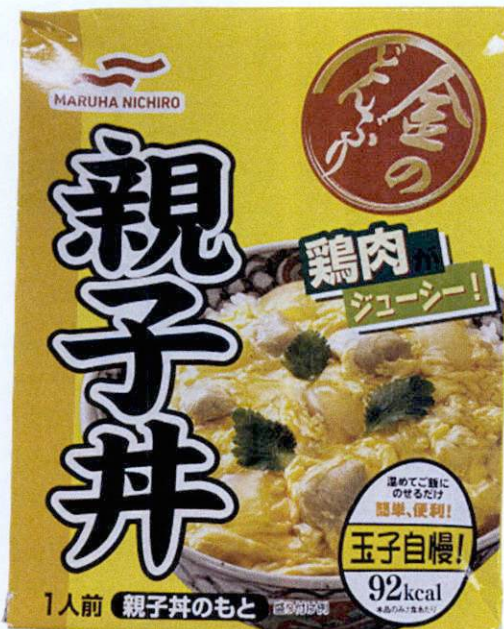
Figure 4. Unregistered MARUHA NICHIRO in a Yellow-colored Carton box (Labels are in foreign characters)