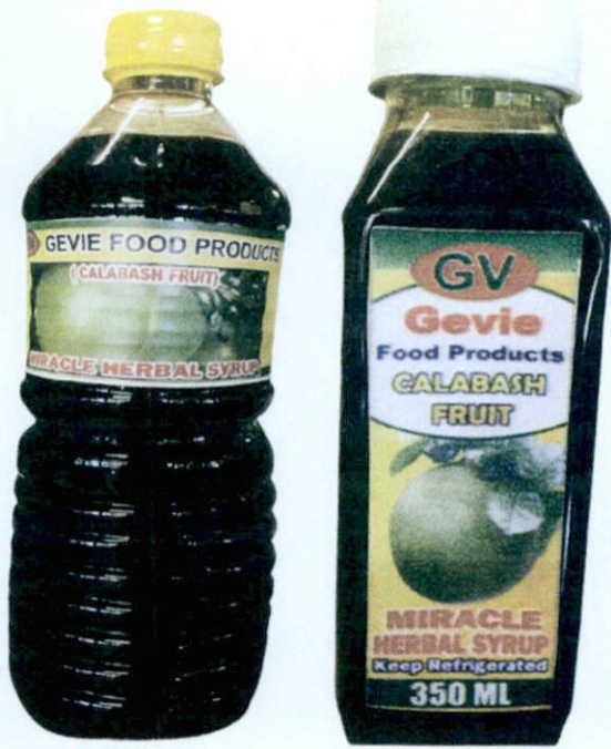
Figure 2. Unregistered GEVIE FOOD PRODUCTS Calabash Fruit Miracle Herbal Syrup