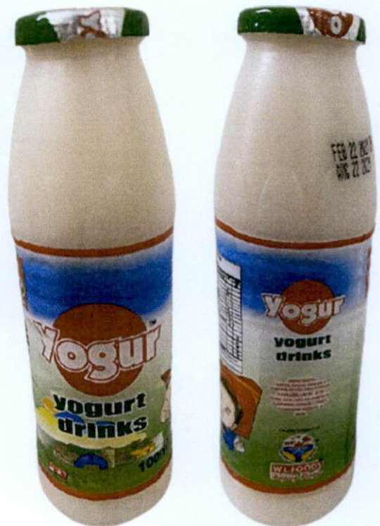
Figure 5. Unregistered YOGUR Yogurt Drinks