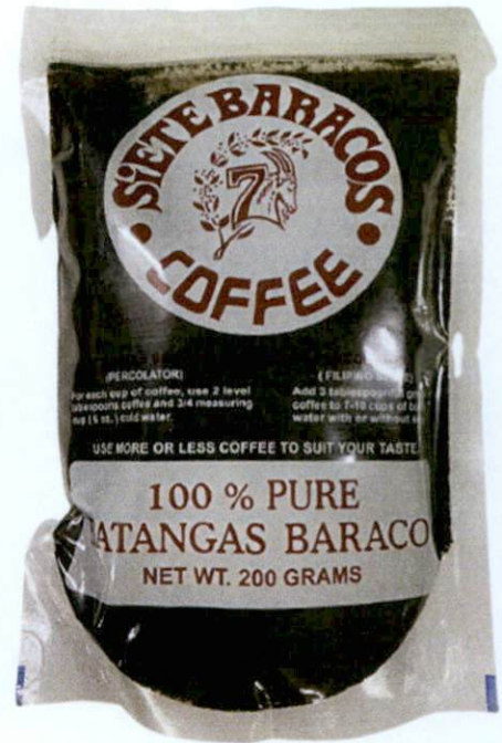
Figure 3. Unregistered SIETE BARACOS Coffee 100% Pure Batangas Baraco, 200 g