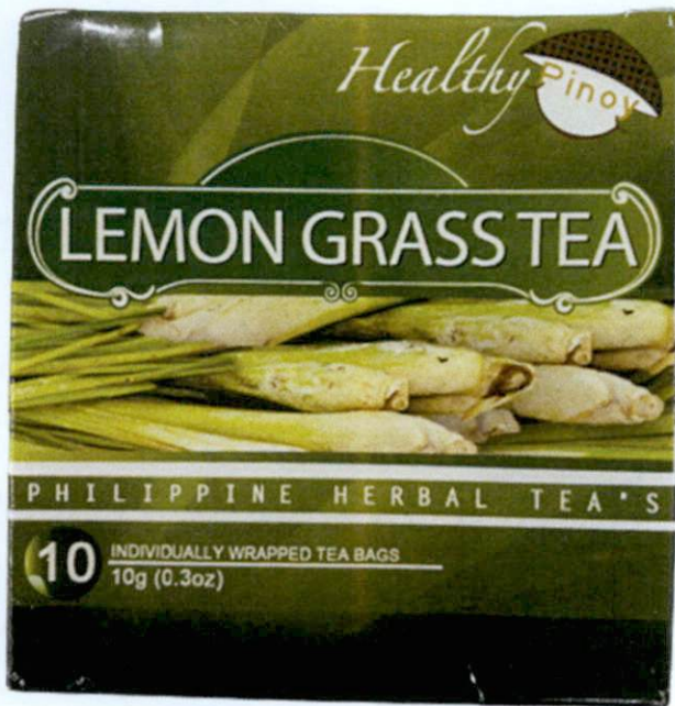
Figure 4. Unregistered HEALTHY PINOY Lemon Grass Tea