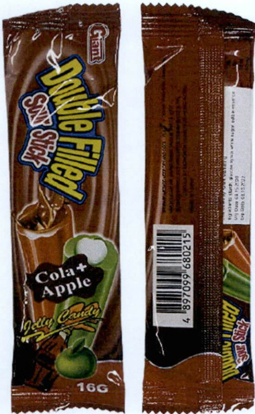
Figure 2. Unregistered GIANT Double Filled Sour Stick Cola+Apple Jelly Candy