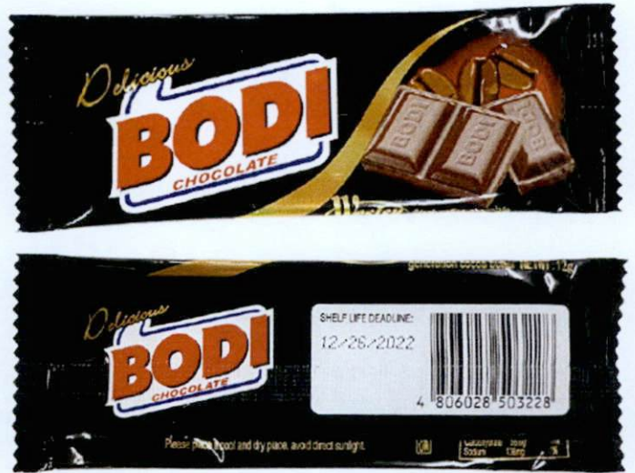
Figure 3. Unregistered DELICIOUS BODI Chocolate