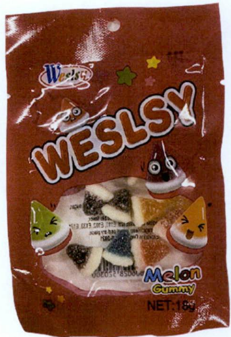
Figure 5. Unregistered WESLSY Melon Gummy