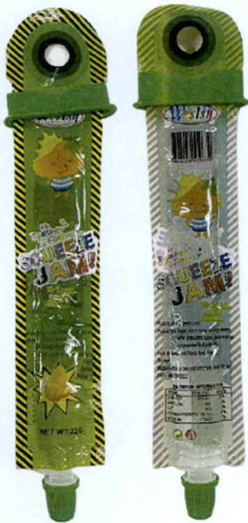
Figure 4. Unregistered WESLSY Squeeze Jam